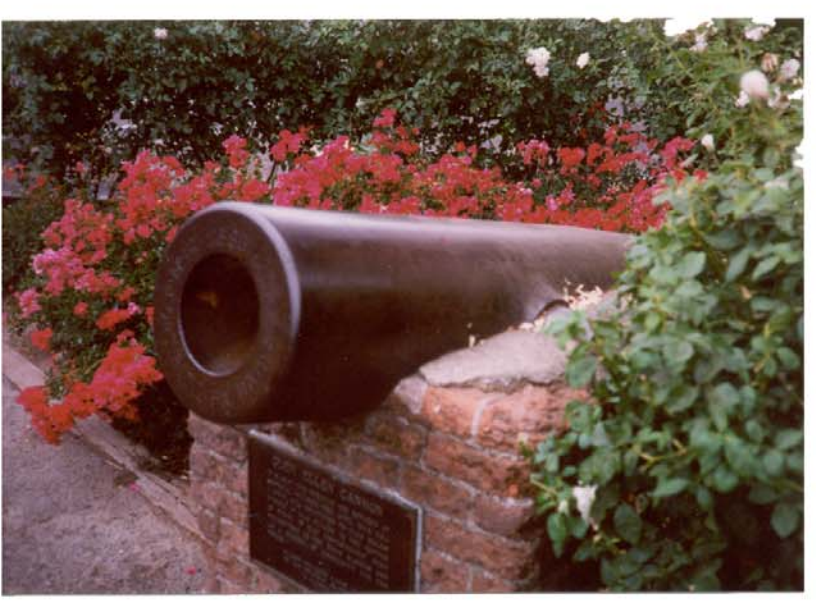
Cannon, looking northwest (undated)