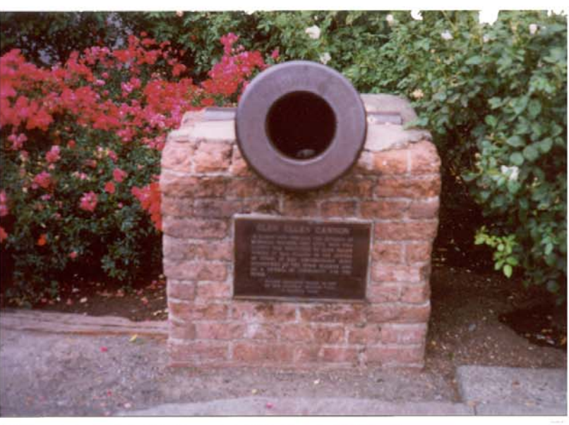
Cannon, looking north (undated)