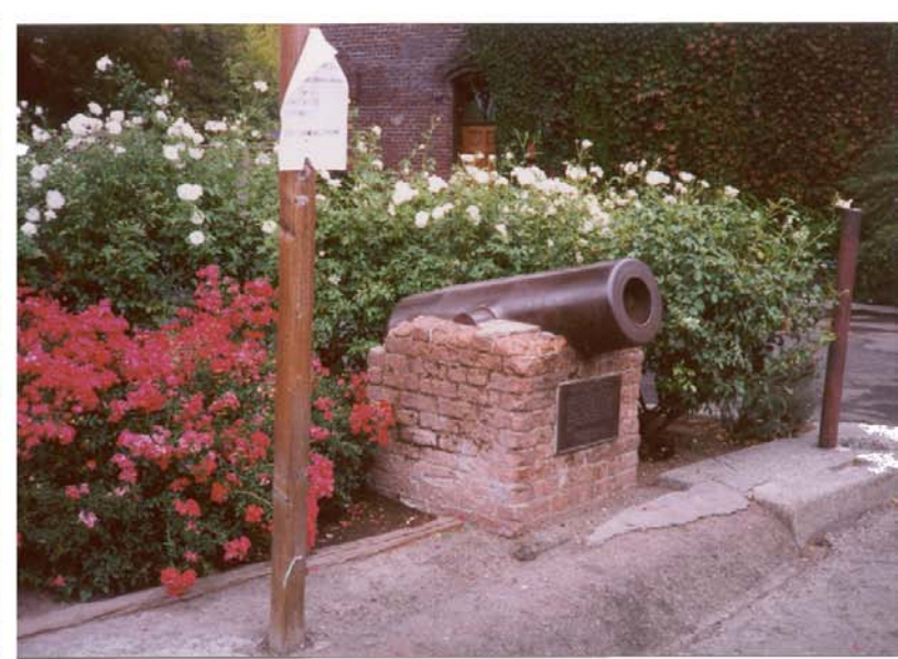
Cannon, looking northeast (undated)