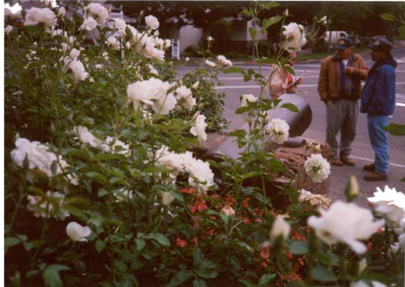
Cannon, looking southeast (undated)