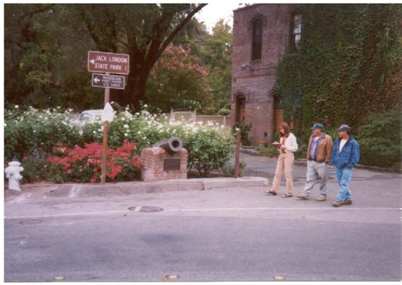
Cannon, showing surroundings (undated)