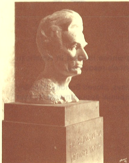
The George Grey Barnard Bust of Lincoln