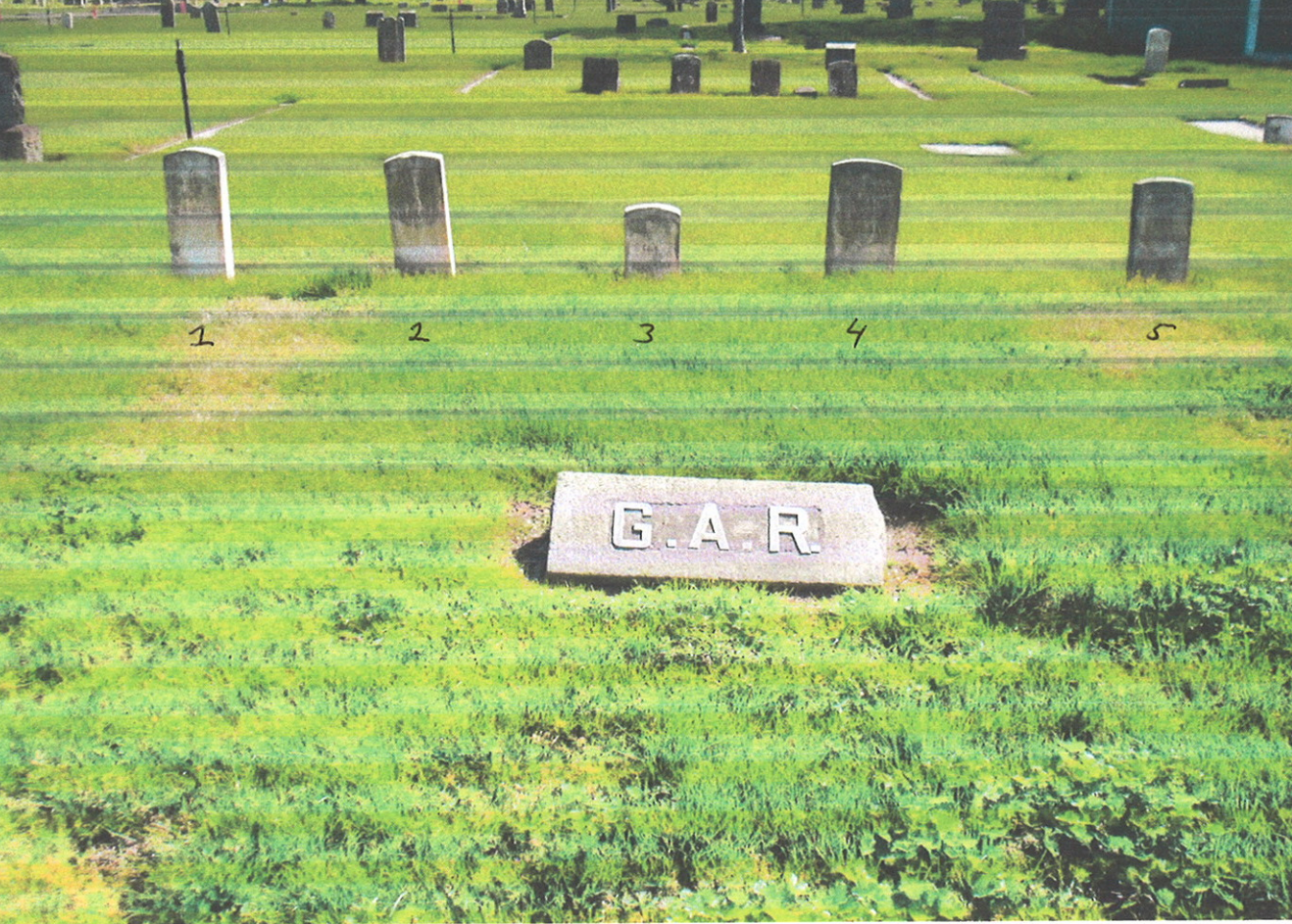
GRAND ARMY OF THE REPUBLIC LOT SECTION D, LOT 28, GRAVES 1-5