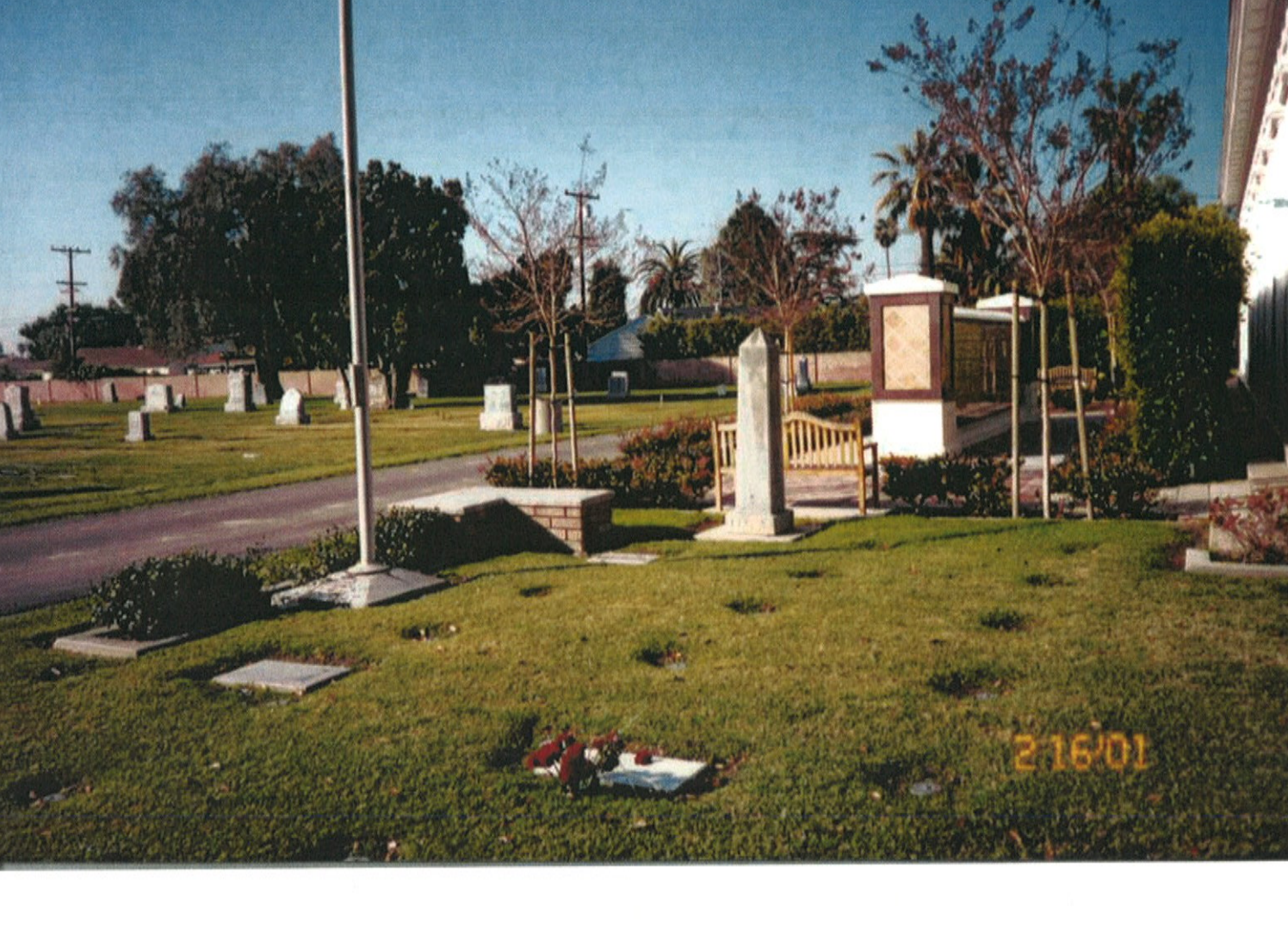
Anaheim Cemetery Anaheim, California Looking Westerly at Monument