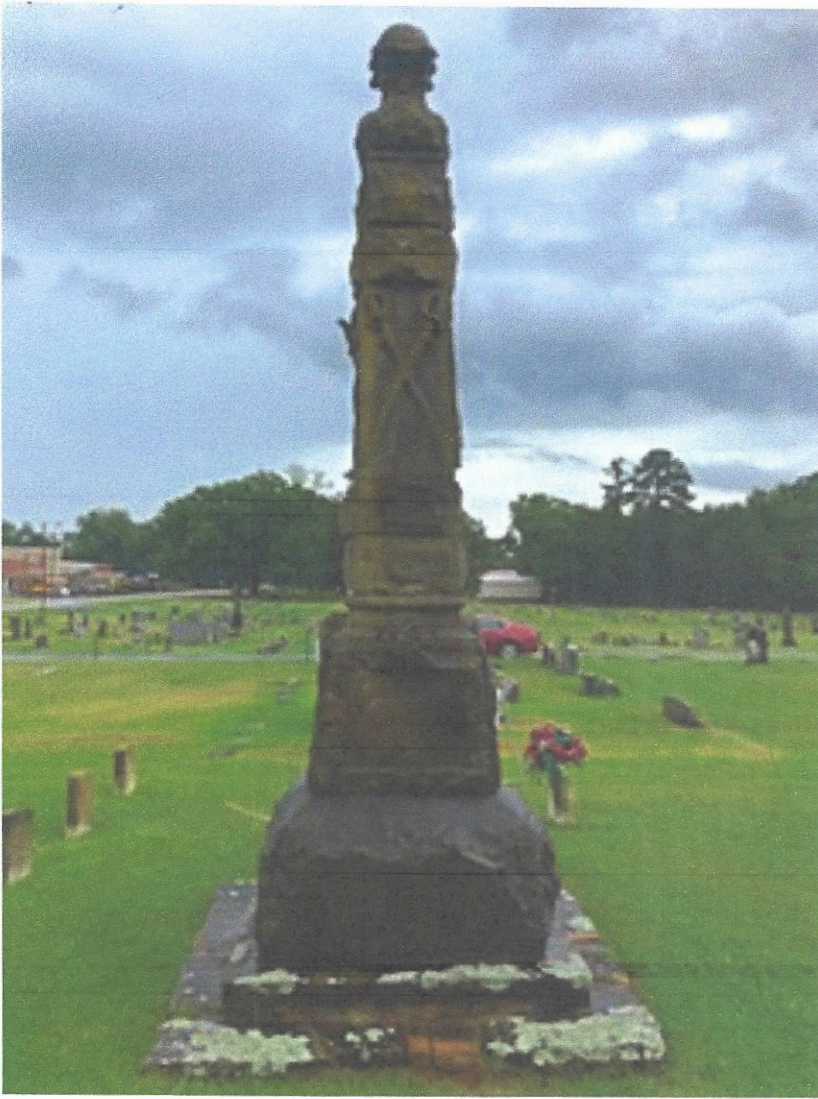
NORTH WEST SIDE