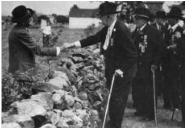
The 1938 version of Hands Across the Wall at the High Water Mark