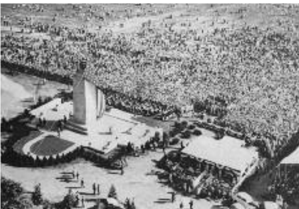
200,000 attend dedication of the Eternal Light Peace Monument

As the 75th anniversary of the Gettysburg battle loomed in the summer of 1938, so did the realization that all the veterans were aging into their 90s. Many were nearly 100. This would be the last great reunion of Union and Confederate soldiers.