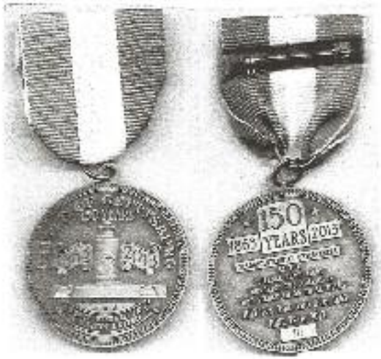
Limited Edition 150th Gettysburg Peace Light Medal $25.00 each

Overstock sale was $12.50 per coin NOW $7.50 EACH Get them before they are gone !