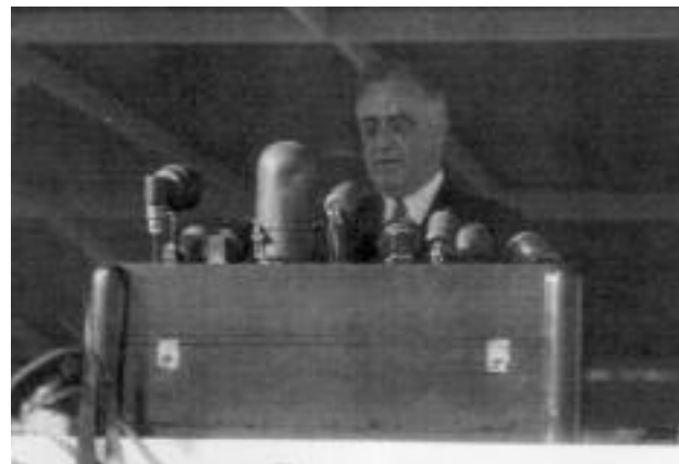
President Franklin D. Roosevelt gave the dedication speech on July 3, 1938