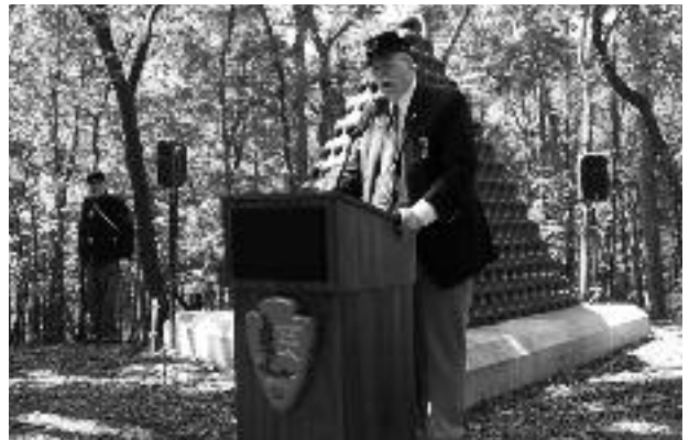
Dedication of the Lytle monument.

Contributions to support Foundation activities are encouraged. Gifts are tax deductible under Sec. 501(c)3 of the U. S. Internal Revenue Code. For more details, visit the Foundation's website at www.suvcw-cf.org .