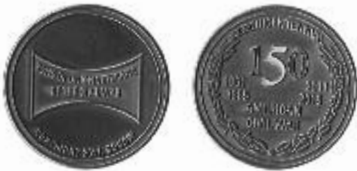
New Item Aluminum Grave Markers for our departed comrades $18.00 per item

Overstock sale was $12.50 per coin NOW $7.50 EACH Get them before they are gone !