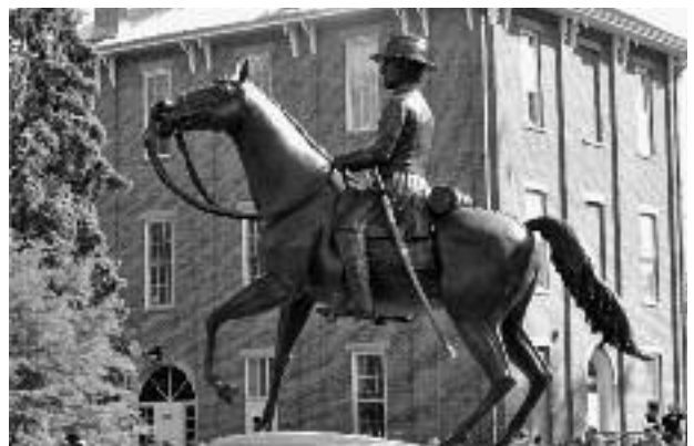
Gen. Rosecrans at Sunbury, OH.