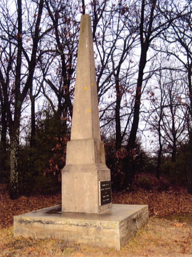
Wautoma, WI Union Com. GAR monument