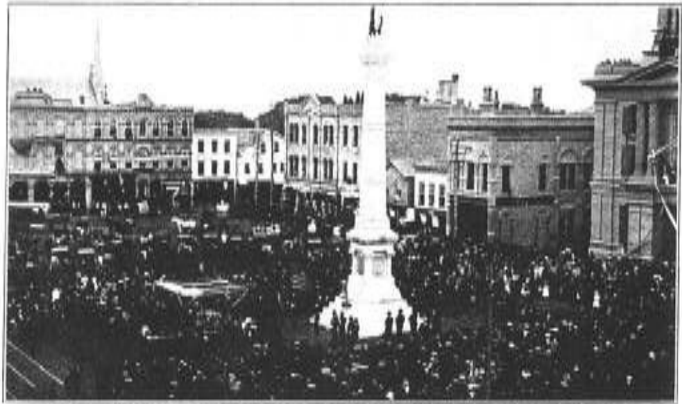
SCENE AT DEDICATION OF SOLDIERS' MONUMENT, RACINE, JULY 4, 1884.

When sufficient funds had been subscribed and otherwise secured, the committee contracted for the monument, and on July 4, 1884, in the presence of thousands of citizens, it was dedicated. It had been decided to have a joint celebration of the Semi-Centennial anniversary of the founding of the city, and the monument dedication. The morning was devoted to the former and began with a "sunrise salute" by the revenue cutter "Andrew Johnson." At 9 o'clock a trades, civic and military parade traversed the main streets of the city, and at 10:30, at the Blake Opera House, was held a meeting of the Old Settlers' Society.