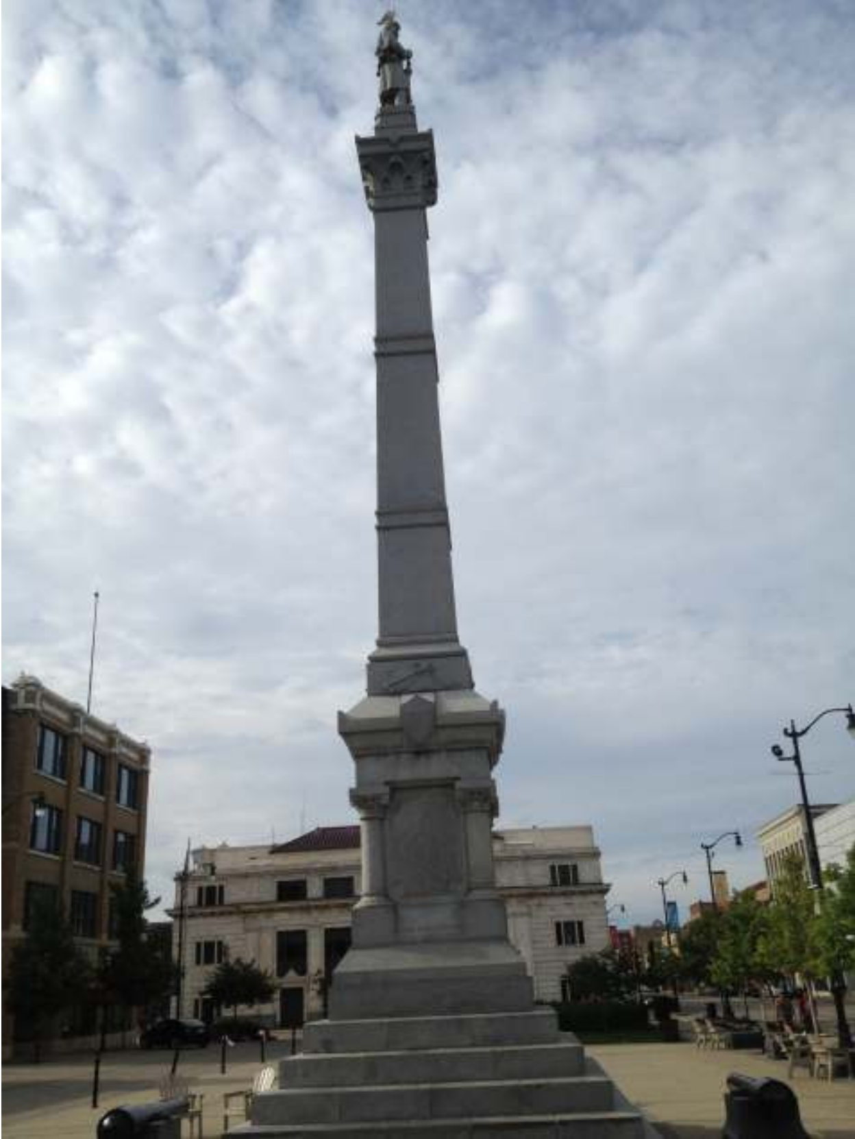
August 2013