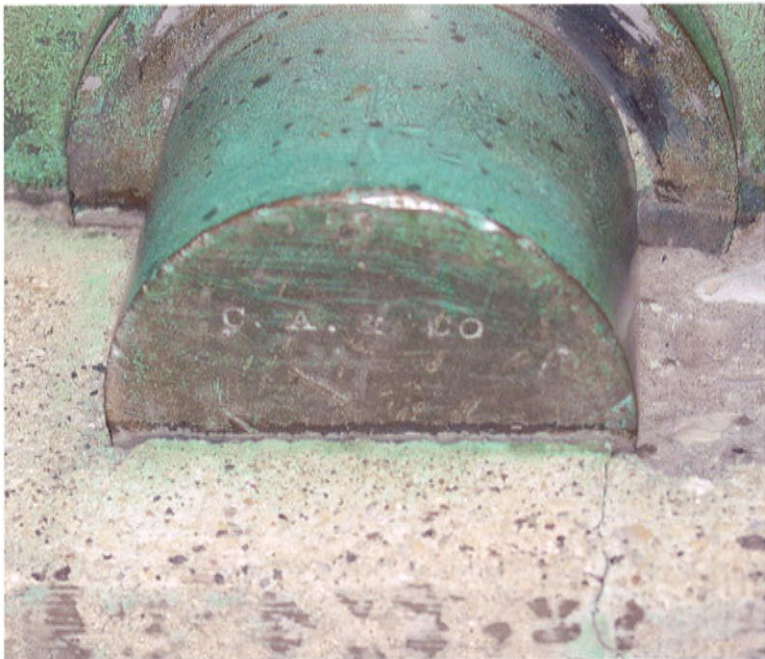
CANNON TUBE, BERLIN, WI VFW GROUNDS