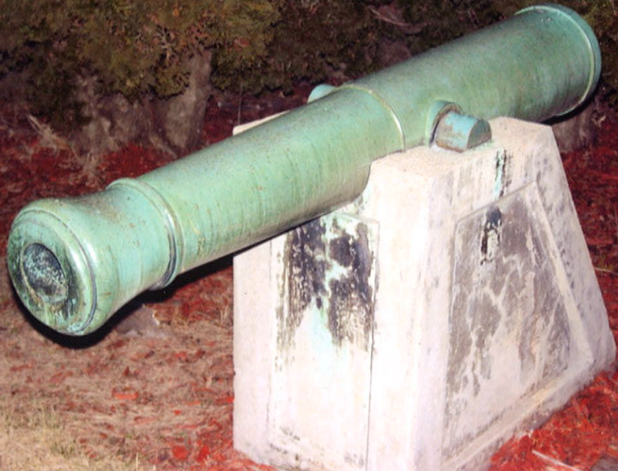
CANNON DISPLAY BERLIN WE VFW GROUNDS