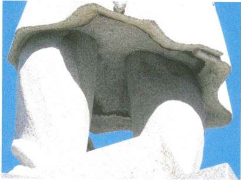
Staining or biological growth on the underside of the statue

Whitman County Courthouse Colfax, WA 2 May 2014