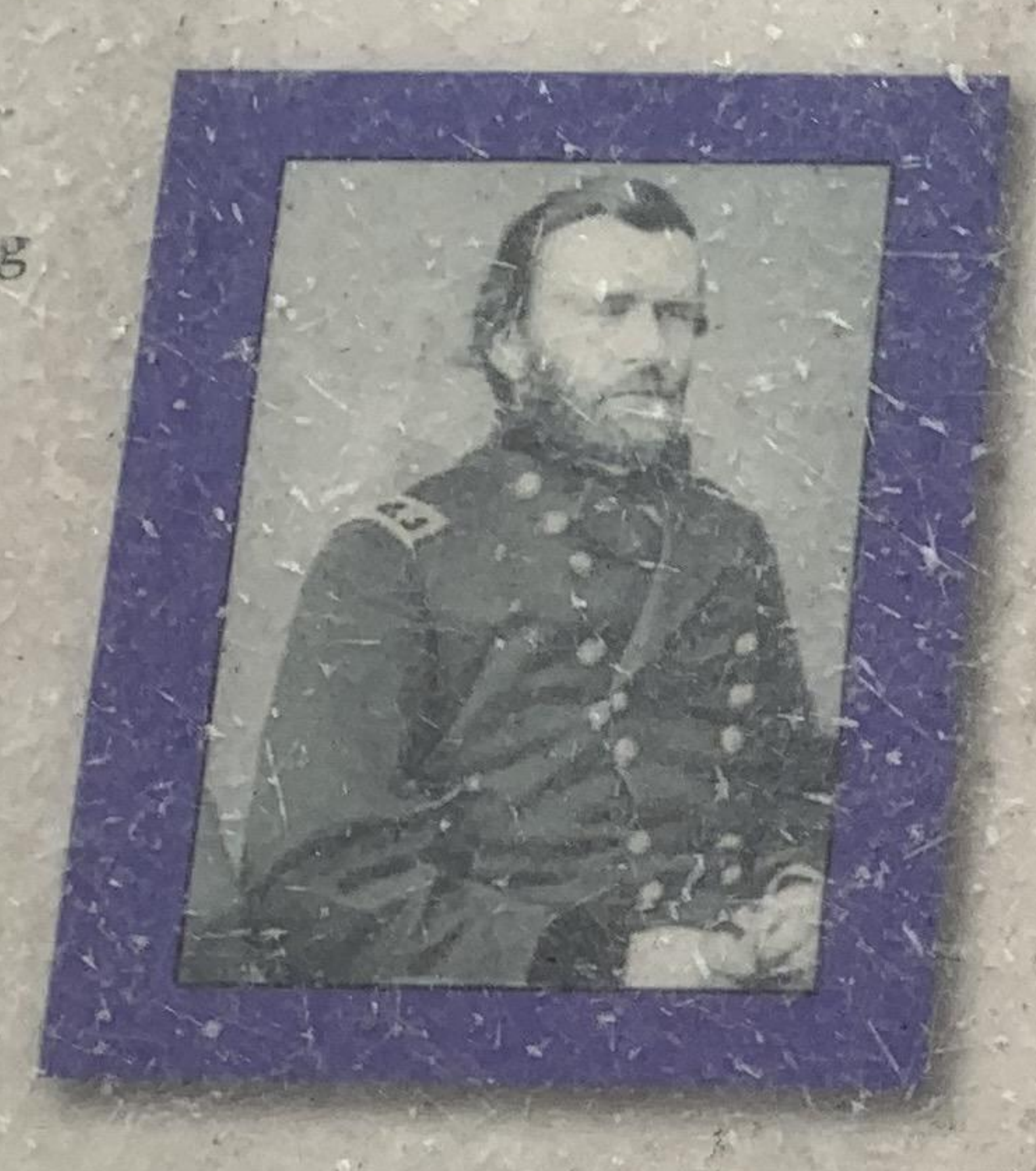
Union General Ulysses Simpson Grant order Union Troops to occupy Smithland early in September 1861

completed nearly a year later in August 1845. By bunty created a need for a separate building to so offices and records. During the depression of the suse that never came to fruition. In 1935 one of the e in the courtyard behind the courthouse. During erected around the public square in the 1850s was so four rooms were added, two on each floor, as courthouse has served as a community center.