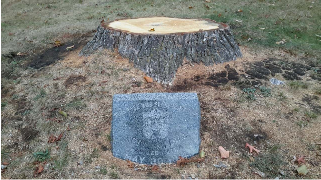
This tree planted by the GAR April 13, 1914 Dedicated May 30, 1914