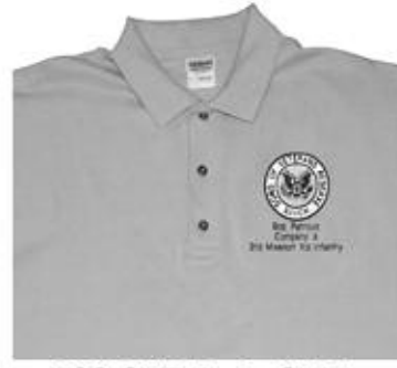
700 SVR Polo Shirt Kersey blue only