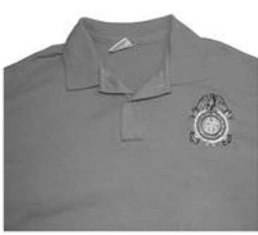
706 SUV Polo Shirt Royal blue, Red or White