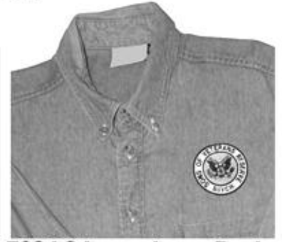
702 LS Long-sleeve Denim 701 SS Short-sleeve Denim