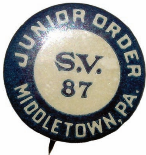
A Camp's Junior membership button

Source: Sons of Veterans USA Proceedings of the Thirty Fourth Annual Encampment of the Commandery-in-Chief c. 1915 Dwight, IL : Banner Print pp. 104-105 Junior Order Committee Report