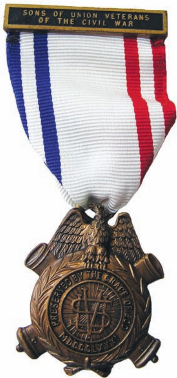
Current Junior Badge

In 1994, a Junior membership was established for boys, ages 8 to 13, within regular Camps of the Sons. The minimum age was lowered to 6 in 2001. At age 14, a Junior becomes a full member with full rights of membership. The Junior badge is the regulation membership top bar and drop suspended by a white ribbon with two blue stripes on the left and two red stripes on the right. In 2010, Junior Associates were established for those lacking blood kinship, but who were interested in the Civil War. Their badge has a solid white ribbon.