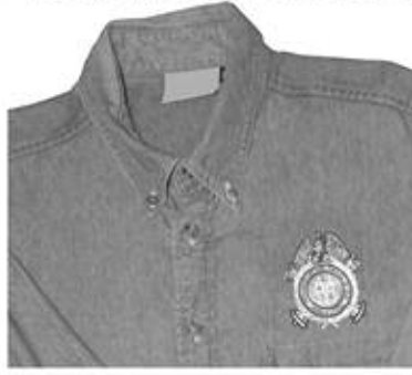
707SS Short-sleeve Denim 708LS Log-sleeve Denim