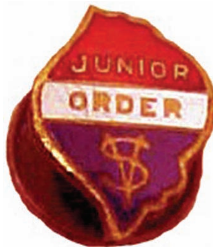
Early Junior membership lapel pin