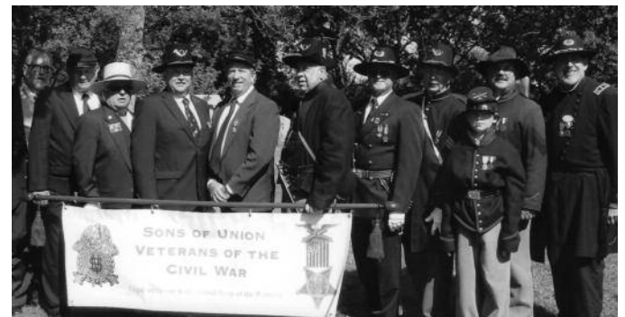
Members of Philip H. Sheridan Camp #2

Sheridan Camp # 2 also worked with local Boy Scouts from Naperville Illinois’s Troop # 889 to clean the headstones of the 43 Civil War veterans who already had markers.