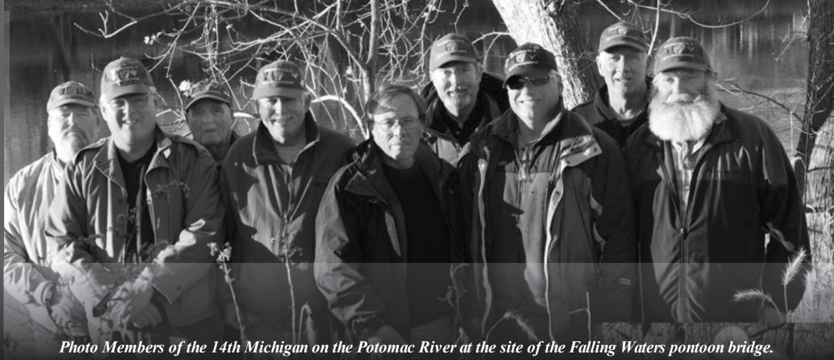
Photo Members of the 14th Michigan on the Potomac River at the site of the Falling Waters pontoon bridge.