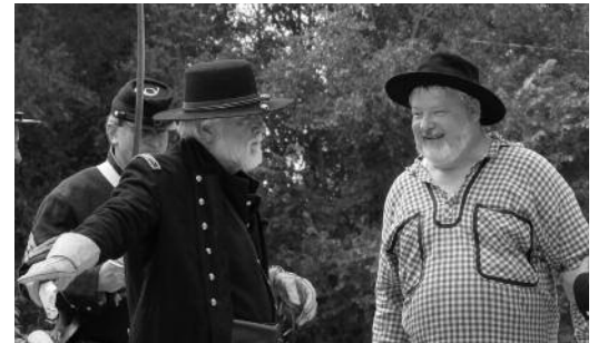
Re-enactment of capture of southern sympathetic bushwhacker under Order 11.