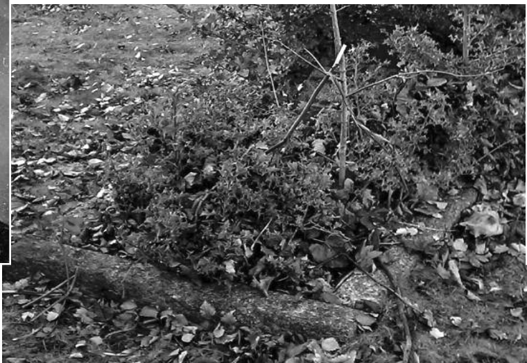
Pvt. William Blazey’s grave site before restoration.