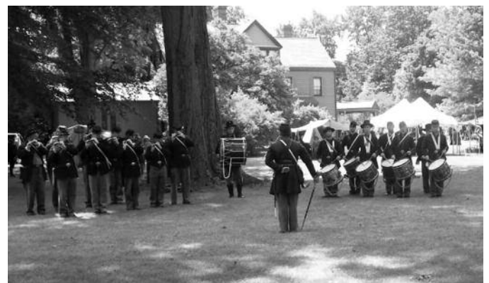
Camp Chase Fifes and Drums