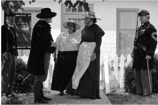
Re-enactment of evacuation of family under Order 11.

Westport Camp 64 commemorated the 150th anniversary of Union Gen. Thomas Ewing issuing Order 11 for western Missouri at the Restoration Heritage Plaza in Independence, Mo.