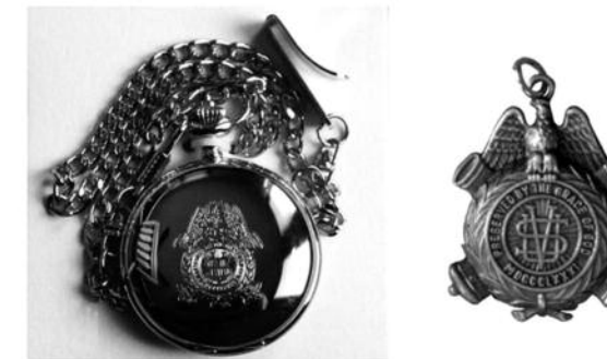
526 527 #526 SUVCW Pocket Watch brushed gold finish w/ engraved logo #527 SUVCW Watch Fob If purchased separately- $65.00 NOW $60.00 + $7.00 shipping