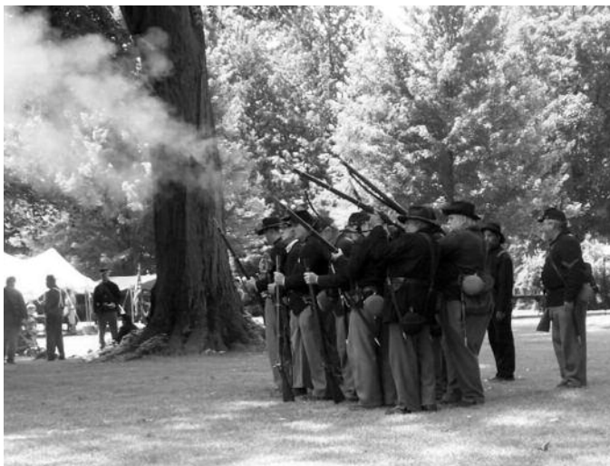
Firing Demonstration by the 7th & 8th Ohio Volunteer Infantry