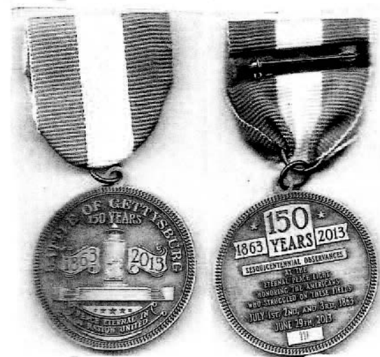
Limited Edition 150th Gettysburg Peace Light Medal $25.00 each

DO NOT ORDER KNIVES THEY ARE OUT OF STOCK