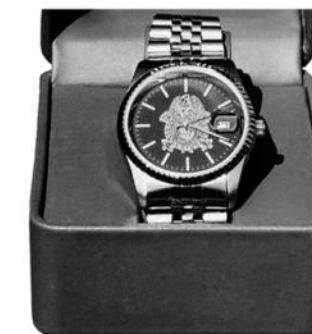
525 #525 SUVCW Wrist Watch gold & silver Band, black face Reg. $60.00 NOW $55.00 + $7.00 shipping MUST USE THIS FORM WHEN ORDERING THE ABOVE SPECIALS