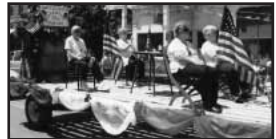
Auxiliary 72 ride their float, set up as a meeting room, in the Ovid Memorial Day Parade.