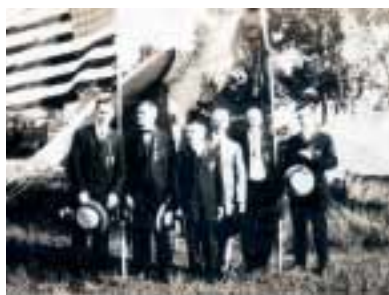
Second Regt Pa. Brig SVR

Installations, Department and National Encampments, Lincoln's Birthday and Tomb Ceremonies, the Civil War Sesquicentennial events of the next 5 years, and of course, activities of the last 125 years. Here are some of the pictures I have saved, that might inspire you to get started.