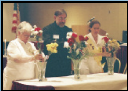
Chaplains prepare for Memorial Service.