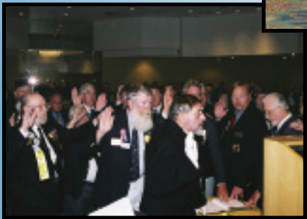
Installation of National Officers.