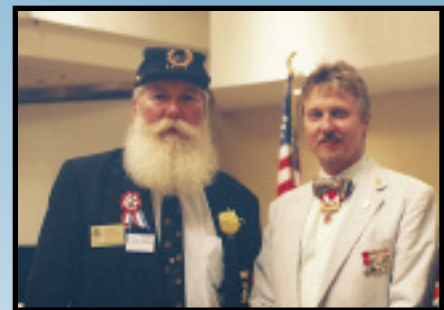
The SCV extends greetings.