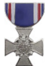
Miniature Badge, Type II