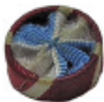
Rosette, Type I