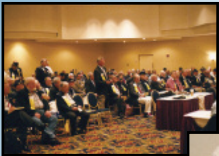
Brothers wait to speak on an issue during the business session.