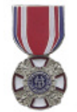
Miniature Badge, Type III