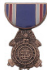
Miniature Badge, Type I