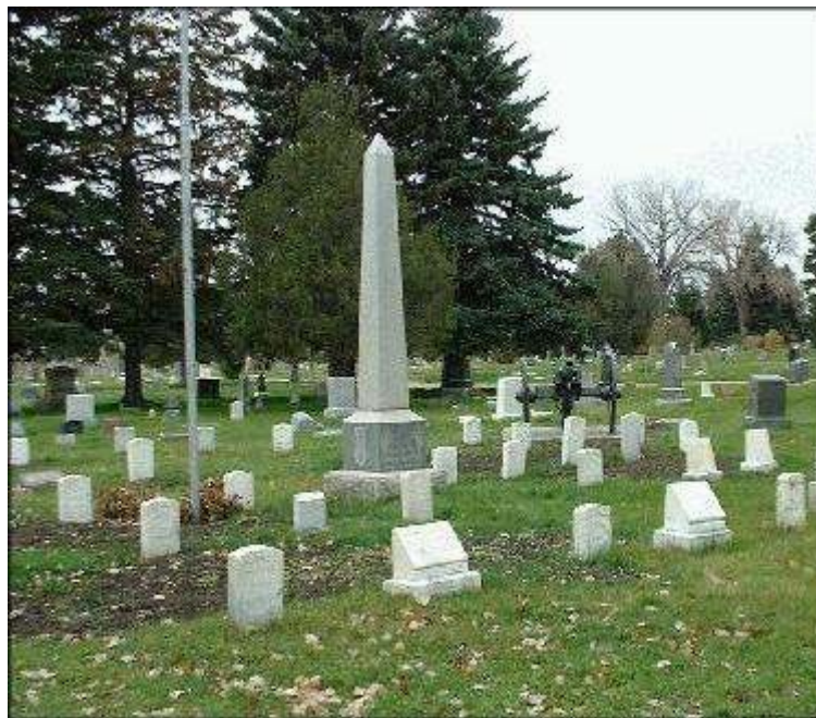
View of GAR Cemetery Plot, Flag Pole, and Right Cannon