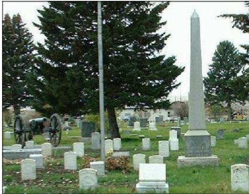
View of GAR Cemetery Plot, Flag Pole, and Left Cannon