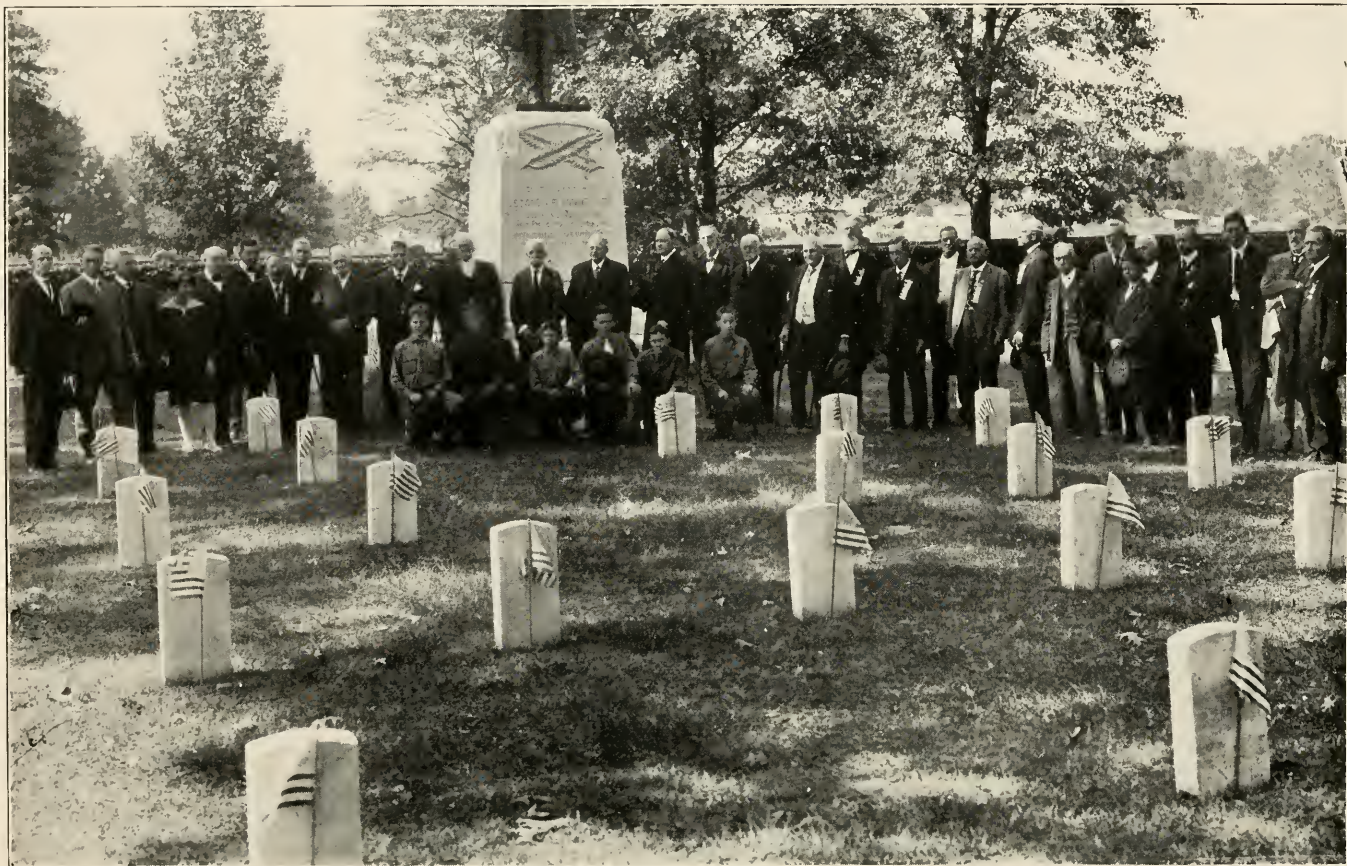
COMMISSION, CITIZENS, BOY SCOUTS AND MONUMENT - MEMPHIS