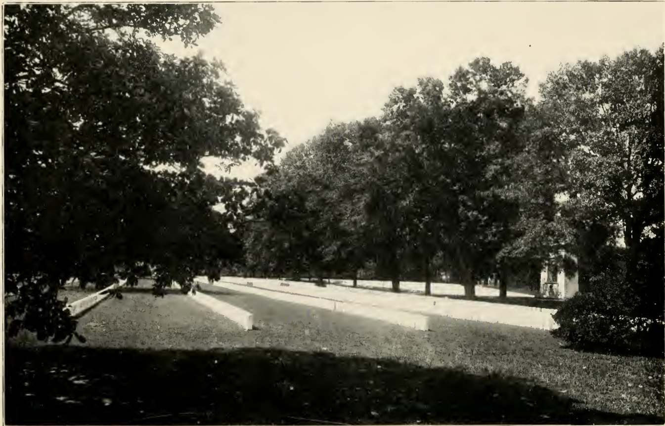
VIEW IN ANDERSONVILLE NATIONAL CEMETERY