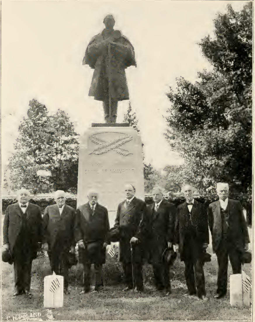
MEMPHIS MONUMENT AND COMMISSION