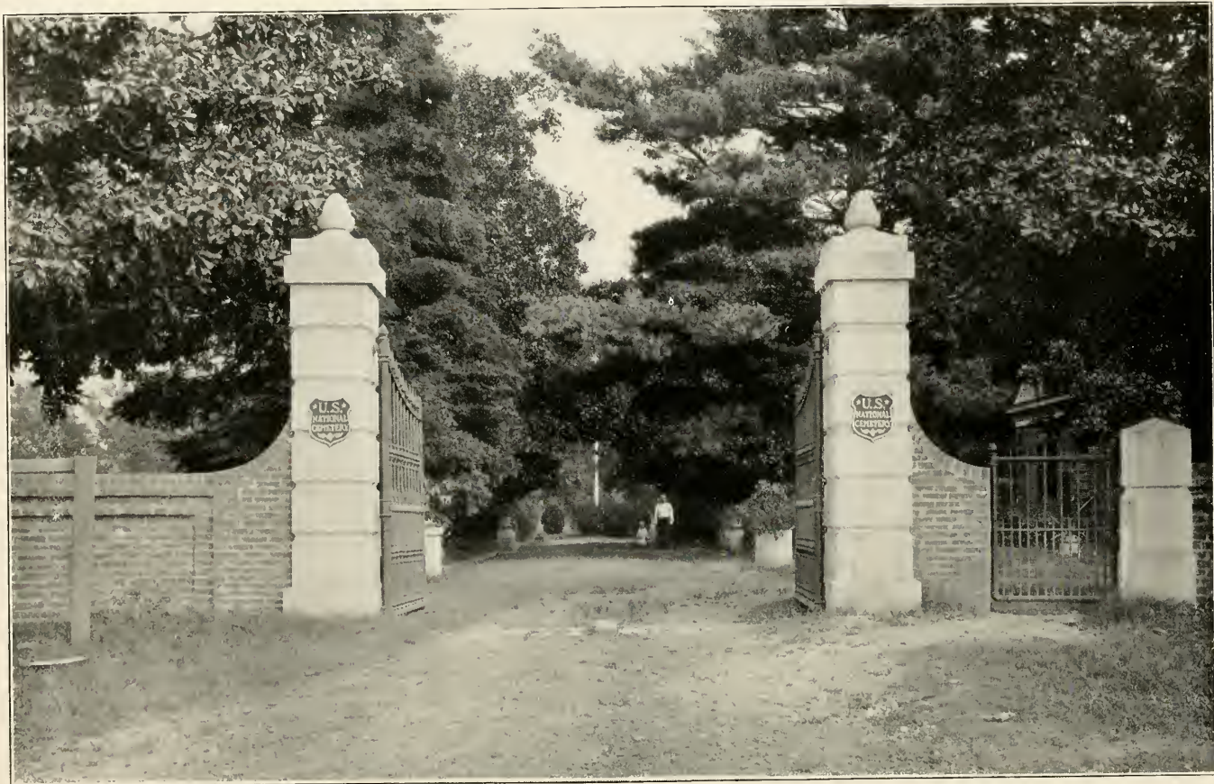
ENTRANCE TO THE NATIONAL CEMETERY, MEMPHIS, TENNESSEE