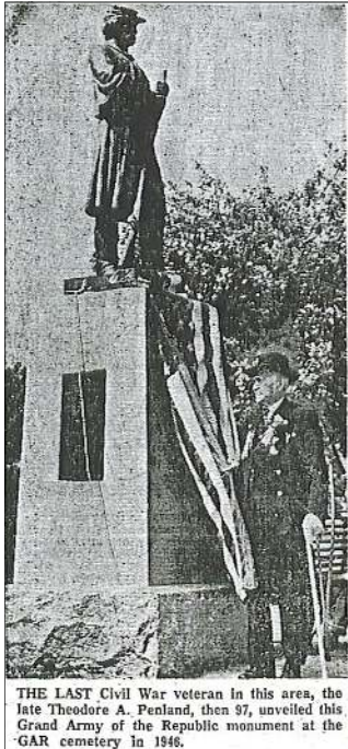
THE LAST Civil War veteran in this area, the late Theodore A. Penland, then 97, unveiled this Grand Army of the Republic monument at the GAR cemetery in 1946.

Dedication of the original statue May 30, 1946 from The Oregonian newspaper.