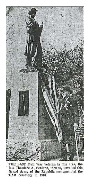
Dedication of the original statue May 30, 1946 from The Oregonian newspaper.