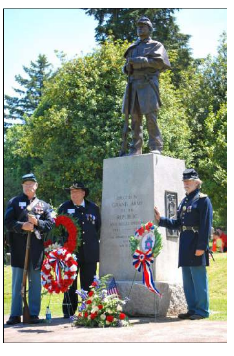
Dedication of the replacement statue May 30, 2009.