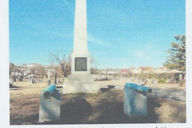
Note the word "Loyalty on second tier