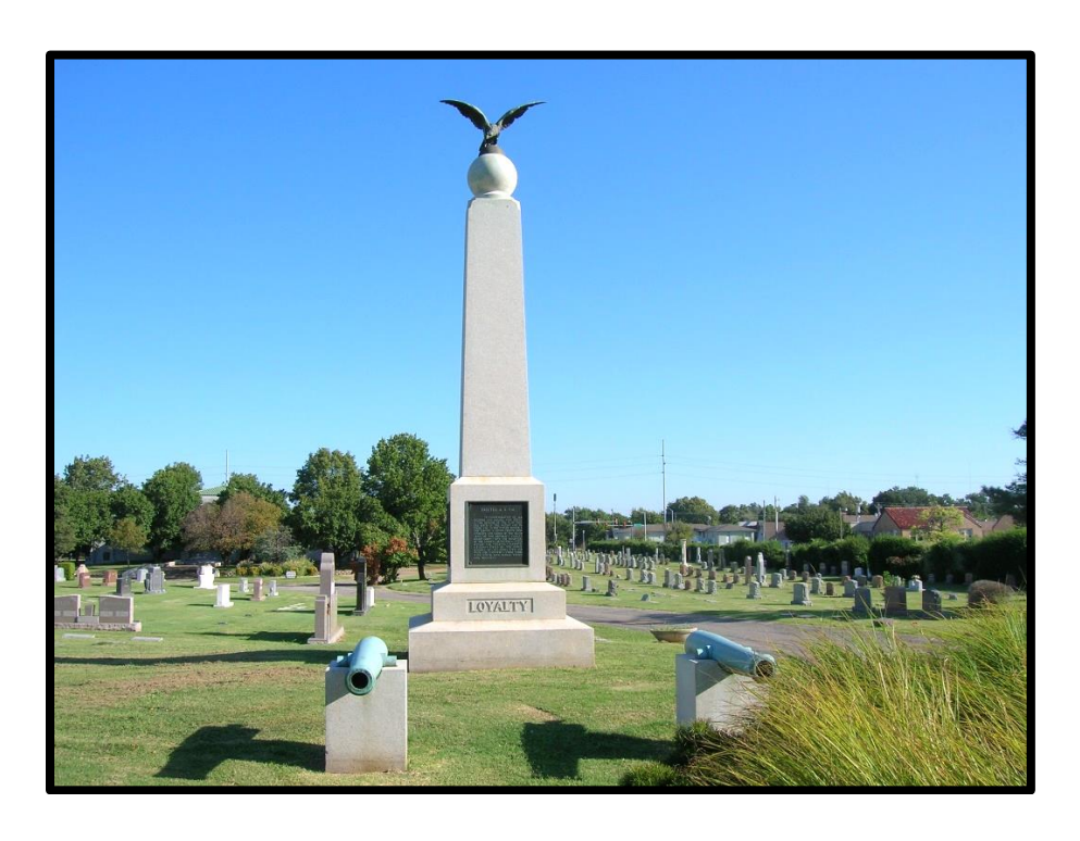
Prior to Restoration - 2019