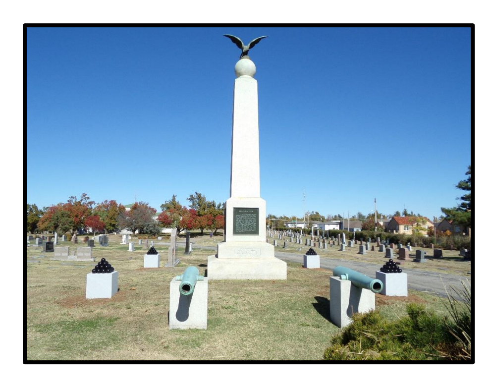
November, 2021 Following Restoration