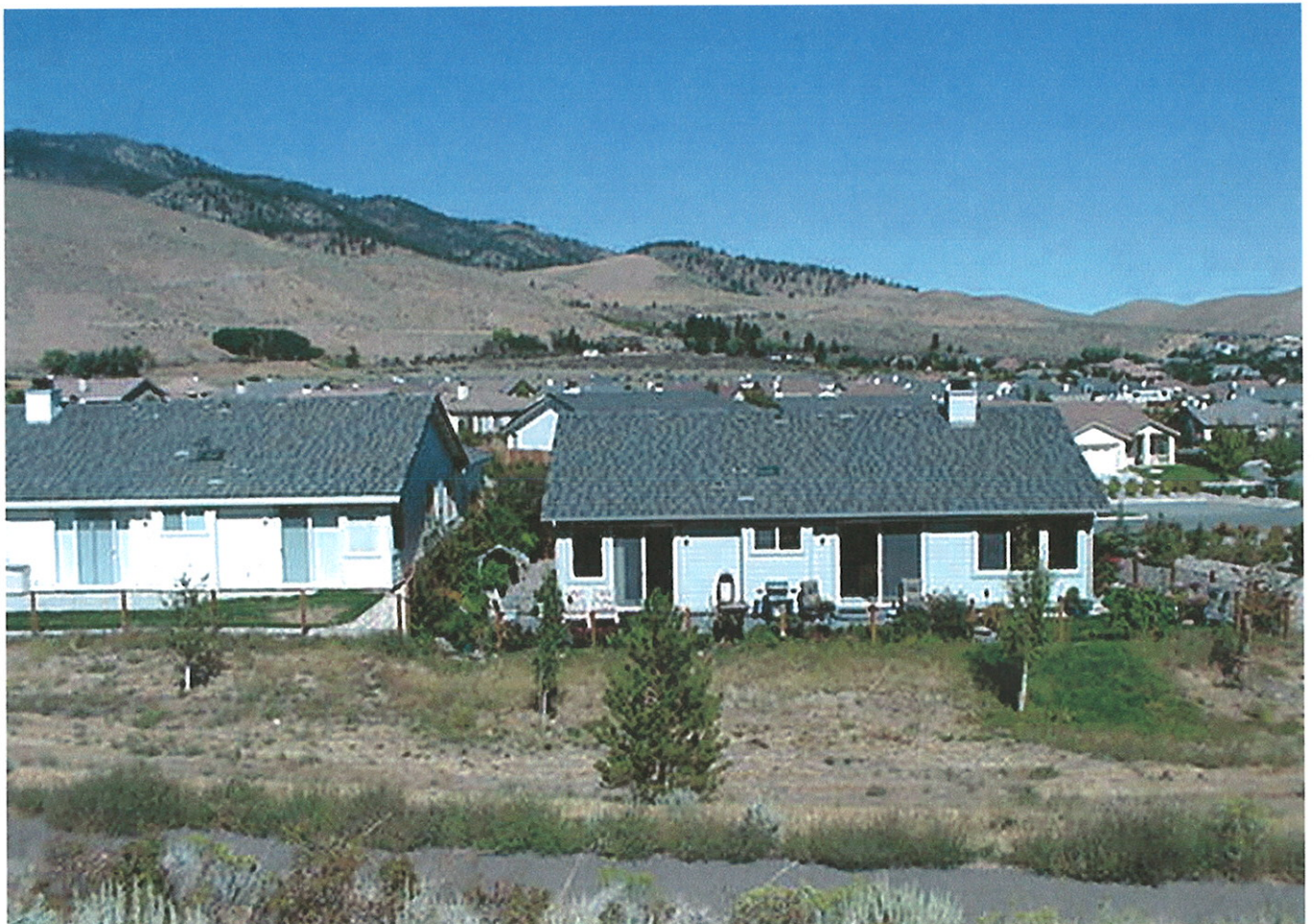
CAMP NYE TODAY!