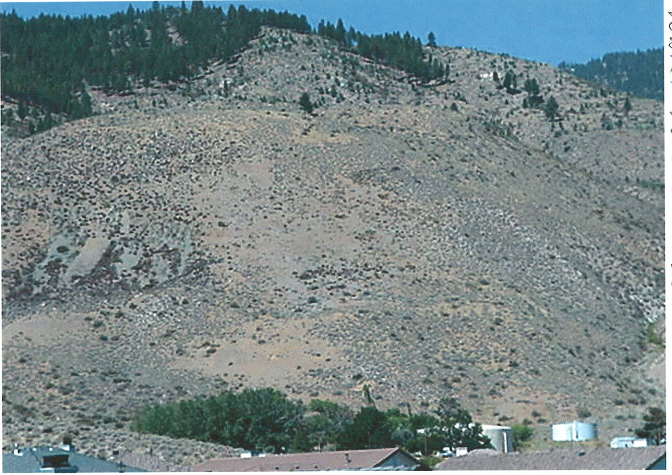
LOOKING EAST AT CAMP NYE NEVADA