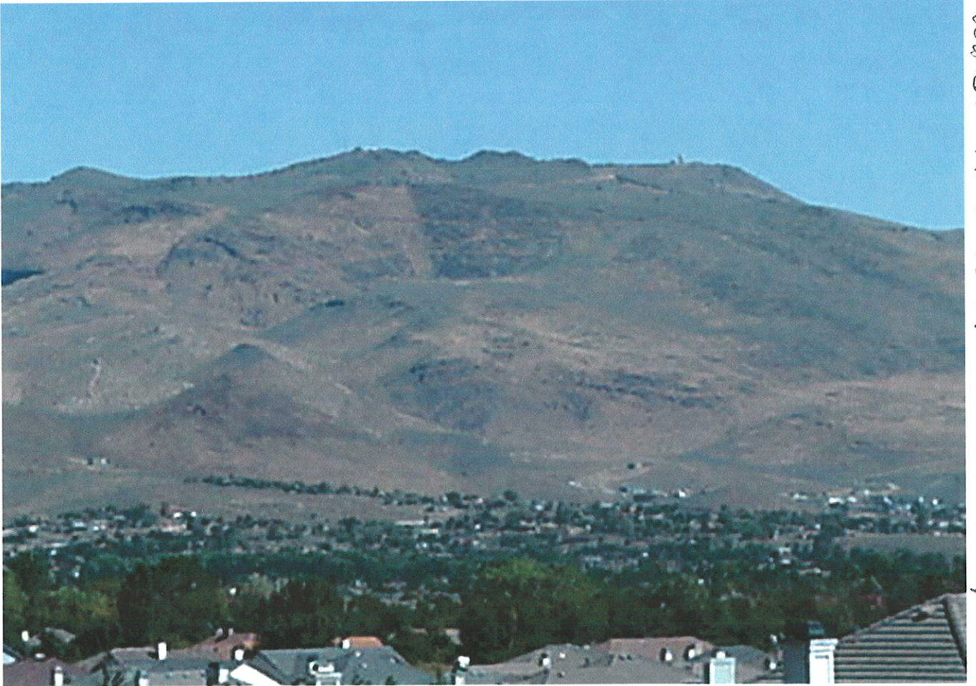
LOOKING WEST AT CAMP NYE NEVADA