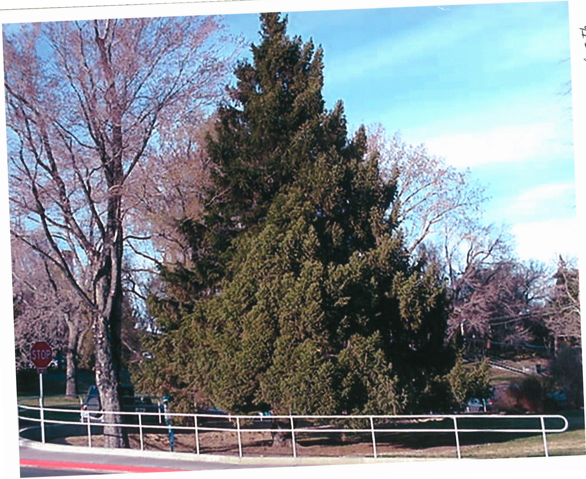
RENO, WASHOE CO., NEVADA SE CORNER CENTER & 9TH