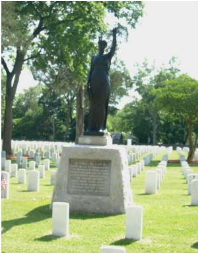
Description: Photo taken May 22, 2019.