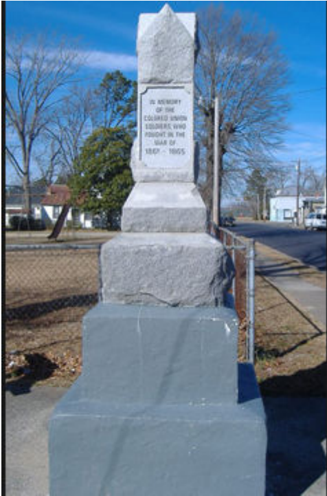
United States Colored Troops Monument. Hertford, N.C.