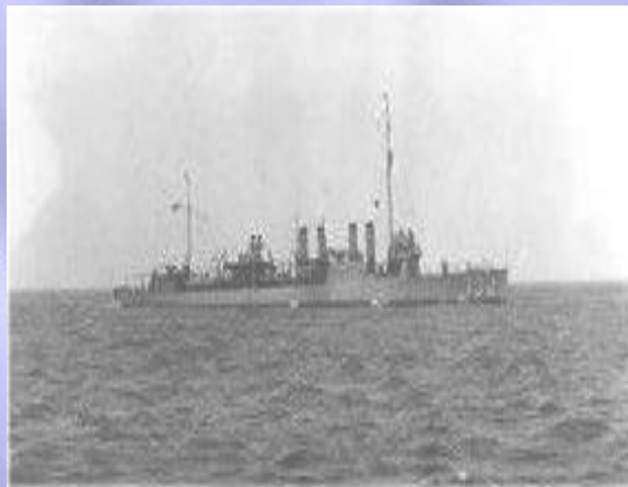
USS Farenholt DD-332