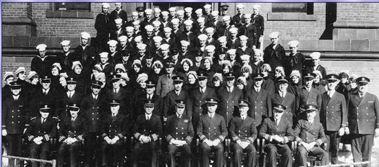
Staff of Great Lakes Naval Hospital, Great Lakes, Illinois, Circa 1924 - 27