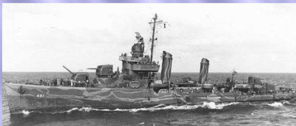
USS Farenholt DD-491