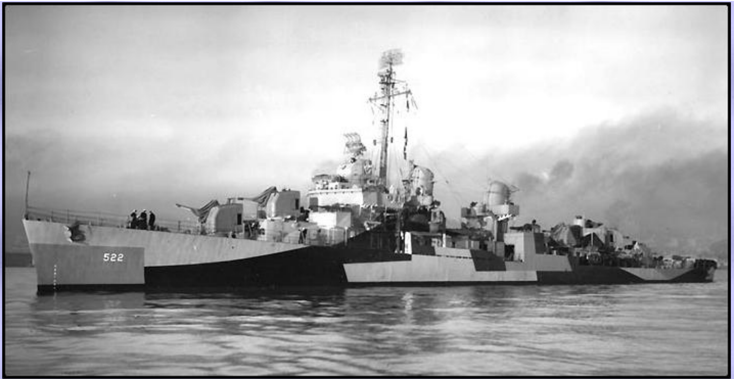
USS Luce (DD-522), 1943-1945

Photographed in 1944, while wearing Camouflage Measure 32, Design 18D.