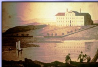
Naval War College Museum Newport, Rhode Island

After the war, Luce organized the Navy's apprentice training program to prepare seamen and petty officers for fleet duty and served as the Naval Academy's Commandant of Midshipmen from October 1865 to June 1868. He was commissioned Commander, July 25, 1866 and commanded the practice squadrons of the Naval Academy. He then returned to sea as commanding officer of the gunboat Mohongo , in the Pacific, and steam sloop Juniata in the Mediterranean Sea, 1866-1872. Promoted to Captain on December 28, 1872, Luce served at the Boston Navy Yard until the autumn of 1875. He then commanded the steam sloop Hartford , flagship of the North Atlantic squadron, in November, 1875 and served as such until August 1877. His later career was heavily involved with educational affairs, initially as Inspector of Training Ships 1877-1878, then in command of the training ship Minnesota 1878-1881, and promoted Commodore, November 25, 1881. As Commodore he commanded the U.S. Training Squadron from 1881 to 1884. He served as President of the Commission on the sale of Navy yards in 1882 and later ordered to the command of the North Atlantic squadron as acting Rear-Admiral, July 26, 1884.