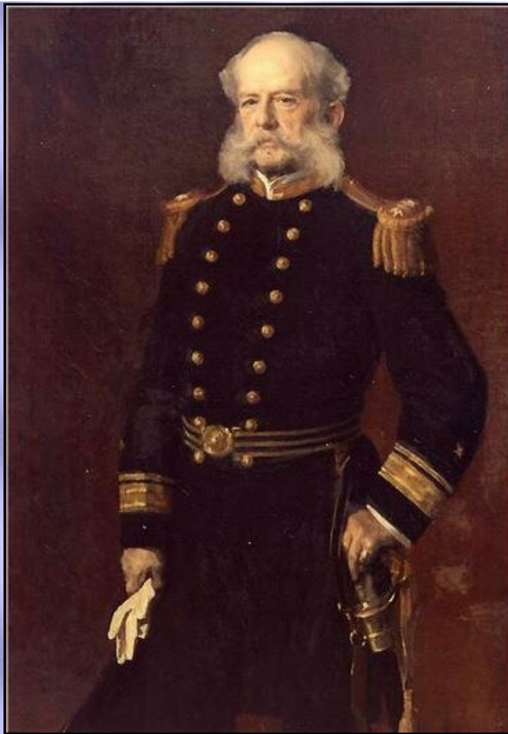
Rear Admiral Stephen B. Luce