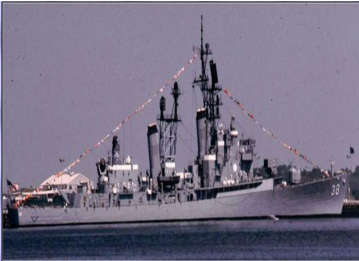
USS Luce (DLG-7, later DDG-38), 1961-1995