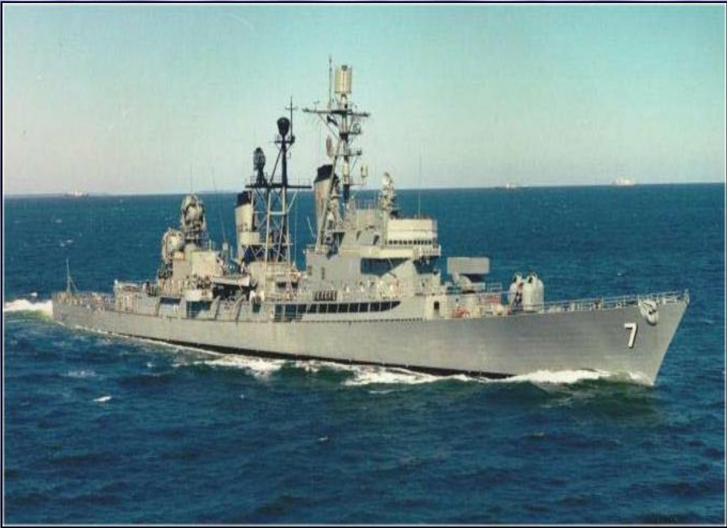
USS Luce (DLG-7, later DDG-38), 1961-1995