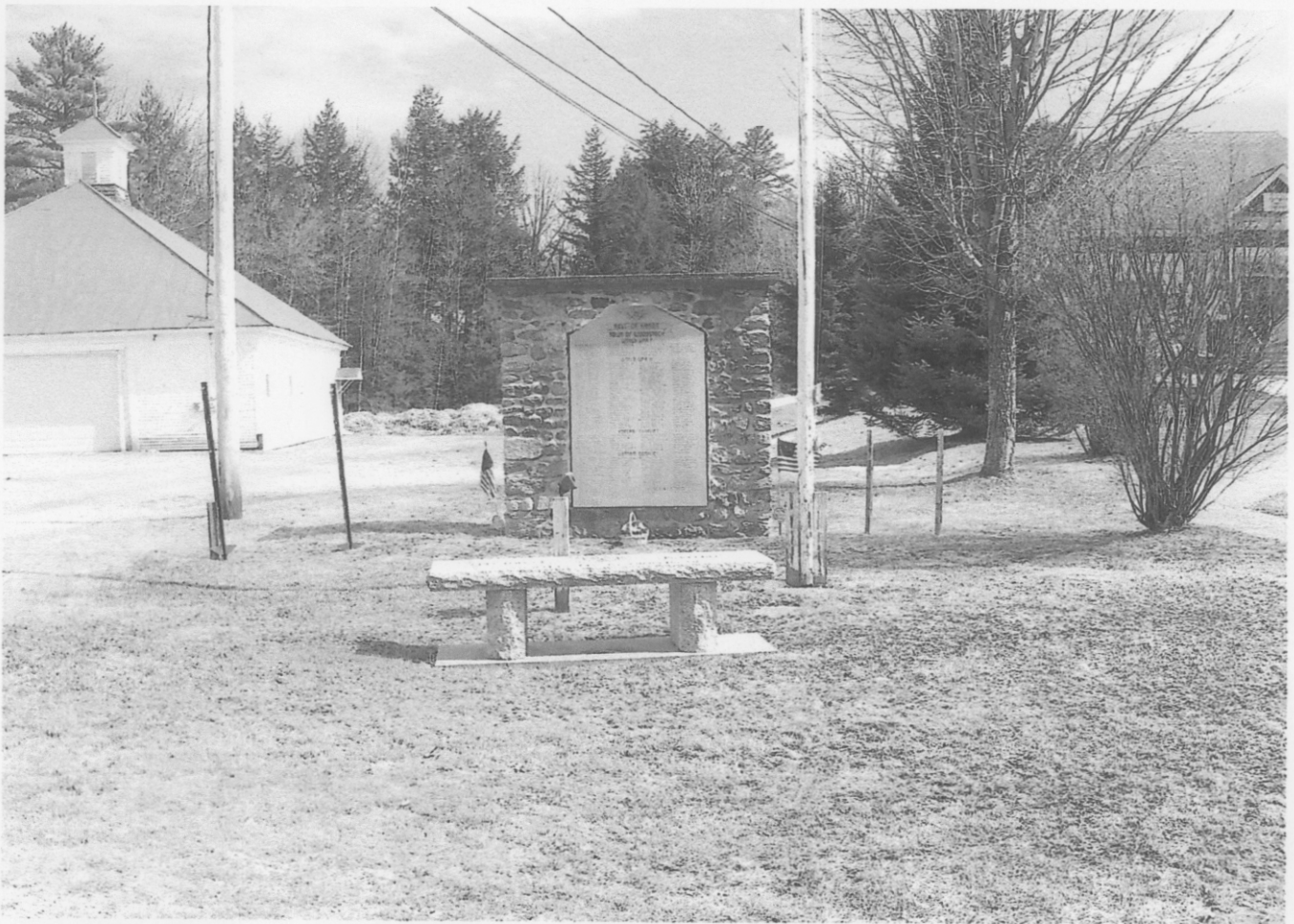
The picture on the top is the present Honor Roll The picture of the bottom is the proposed placement of the new granite.