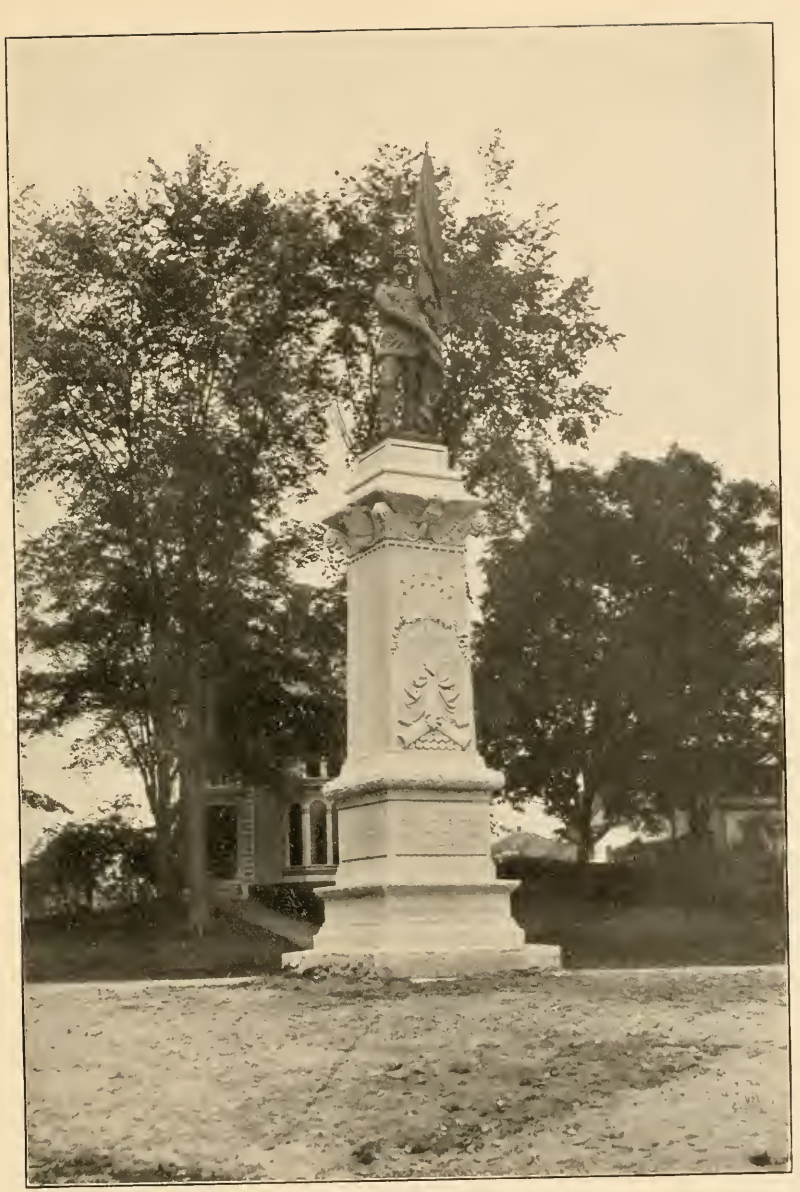
SOLDIERS' MONUMENT, BRIDGTON, MAINE DEDICATED JULY 21, 1910