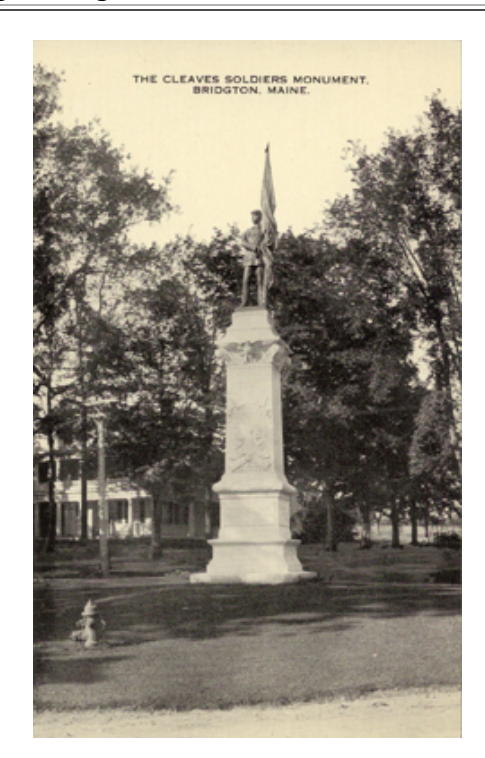
Post card view, c.1915