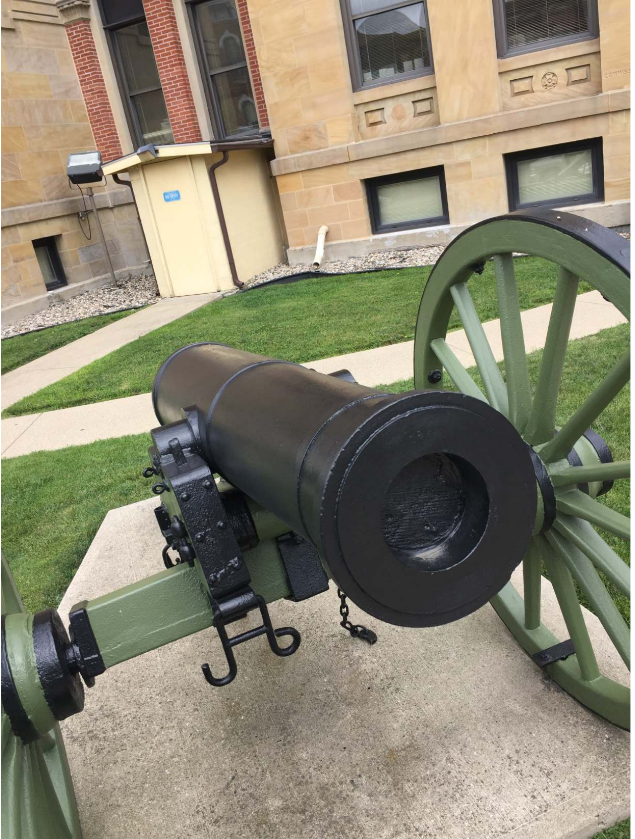
Crawfordsville Cannon(s) N40;2;30. 750000 W86;54;4. 1.79999 Altitude 233. 1.76560