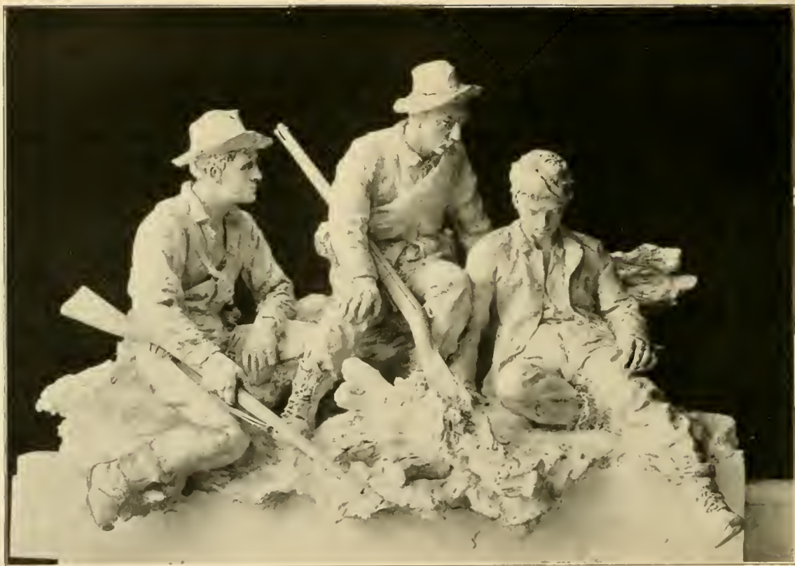
WAR GROUP OVER CASCADE.