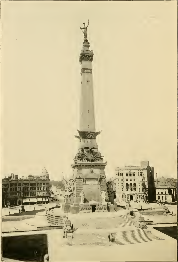
MONUMENT, SOUTH SIDE.