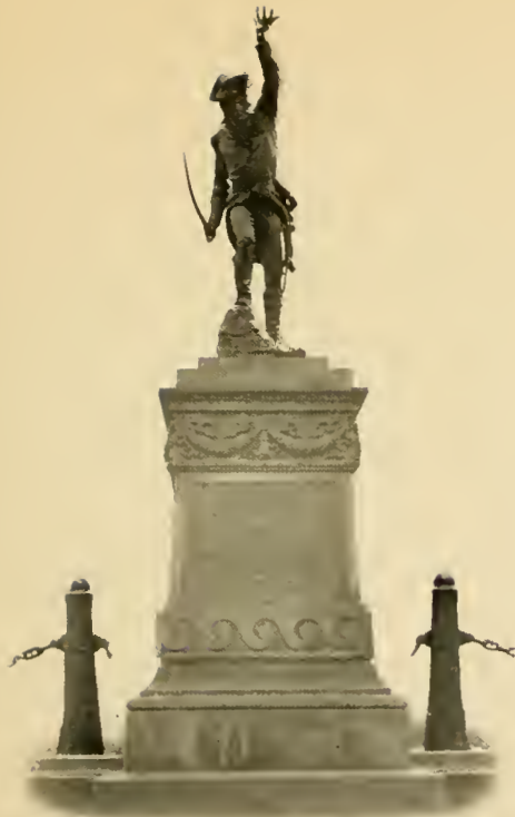
GEORGE ROGERS CLARK,

exchanged the motors for those of sufficient power to meet the demands. The army astragal, designed by Nicolaus Geiger and contracted for by the Board of Commissioners, was placed in position in the late months of 1895, and the cement pavements around the cascades completed.