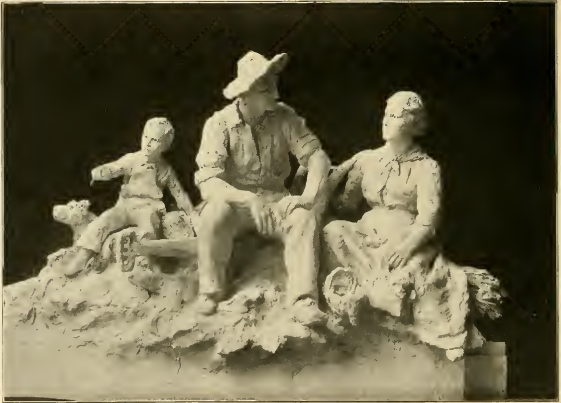
PEACE GROUP OVER CASCADE.