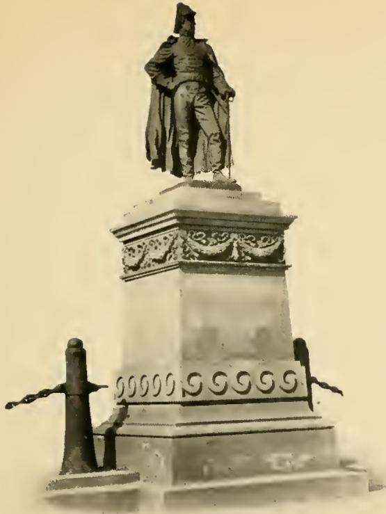
GEN. WM. H. HARRISON.