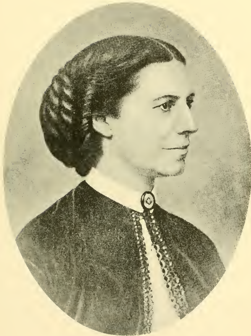
CLARA BARTON AT TIME OF CIVIL WAR