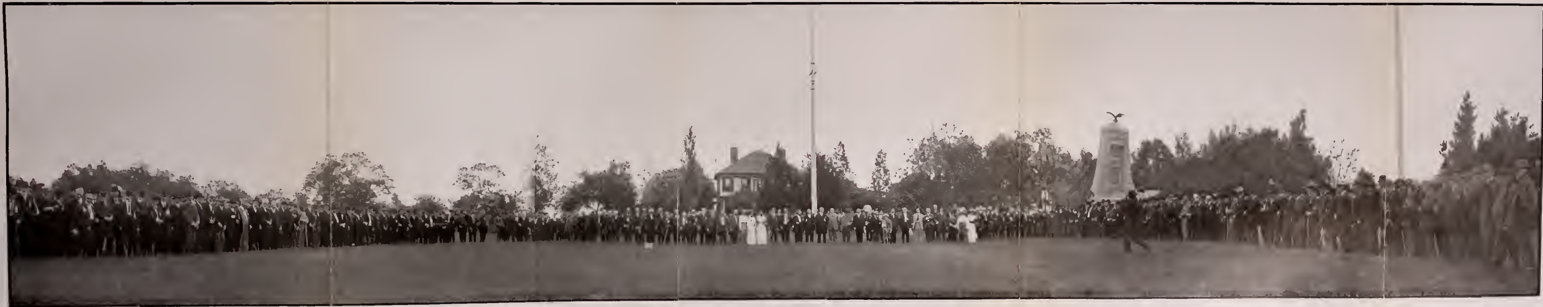
LINE UP AT ANDERSONVILLE FOR PRESENTATION OF NEW YORK STATE'S COMMEMORATIVE DEDICATION MEDAL