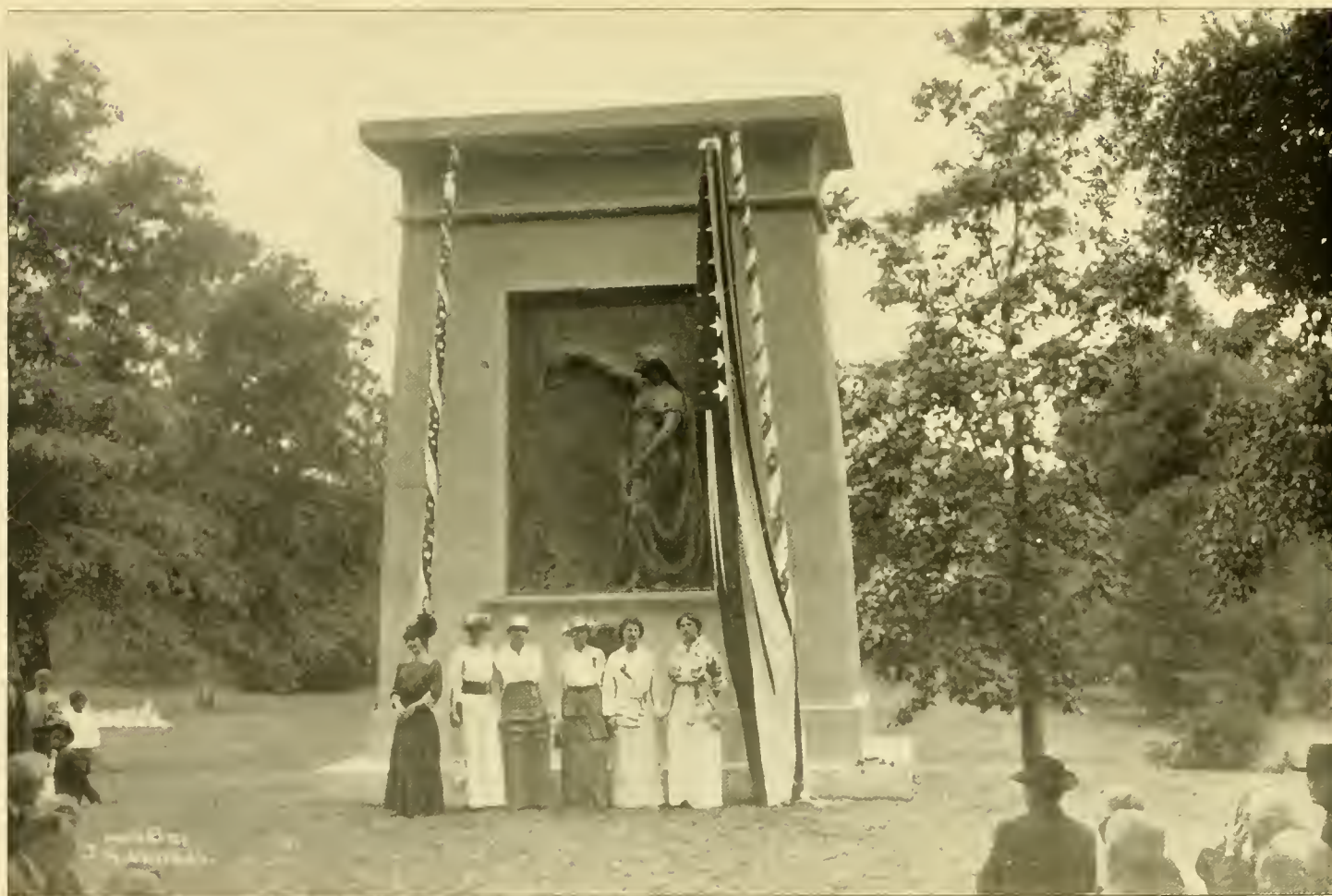
DEDICATION OF MONUMENT AT ANDERSONVILLE