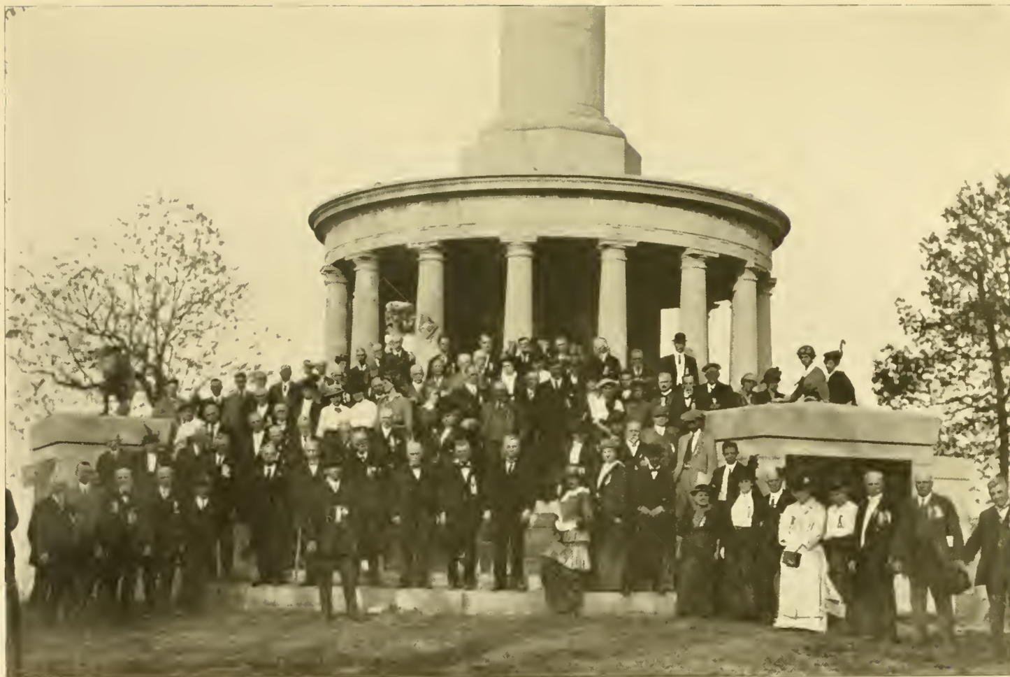
DEDICATION PARTY AT THE FOOT OF NEW YORK MONUMENT, LOOKOUT MOUNTAIN, TENN.