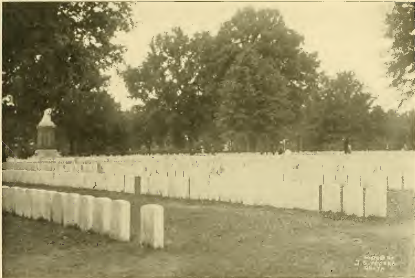
UNION DEAD IN ANDERSONVILLE