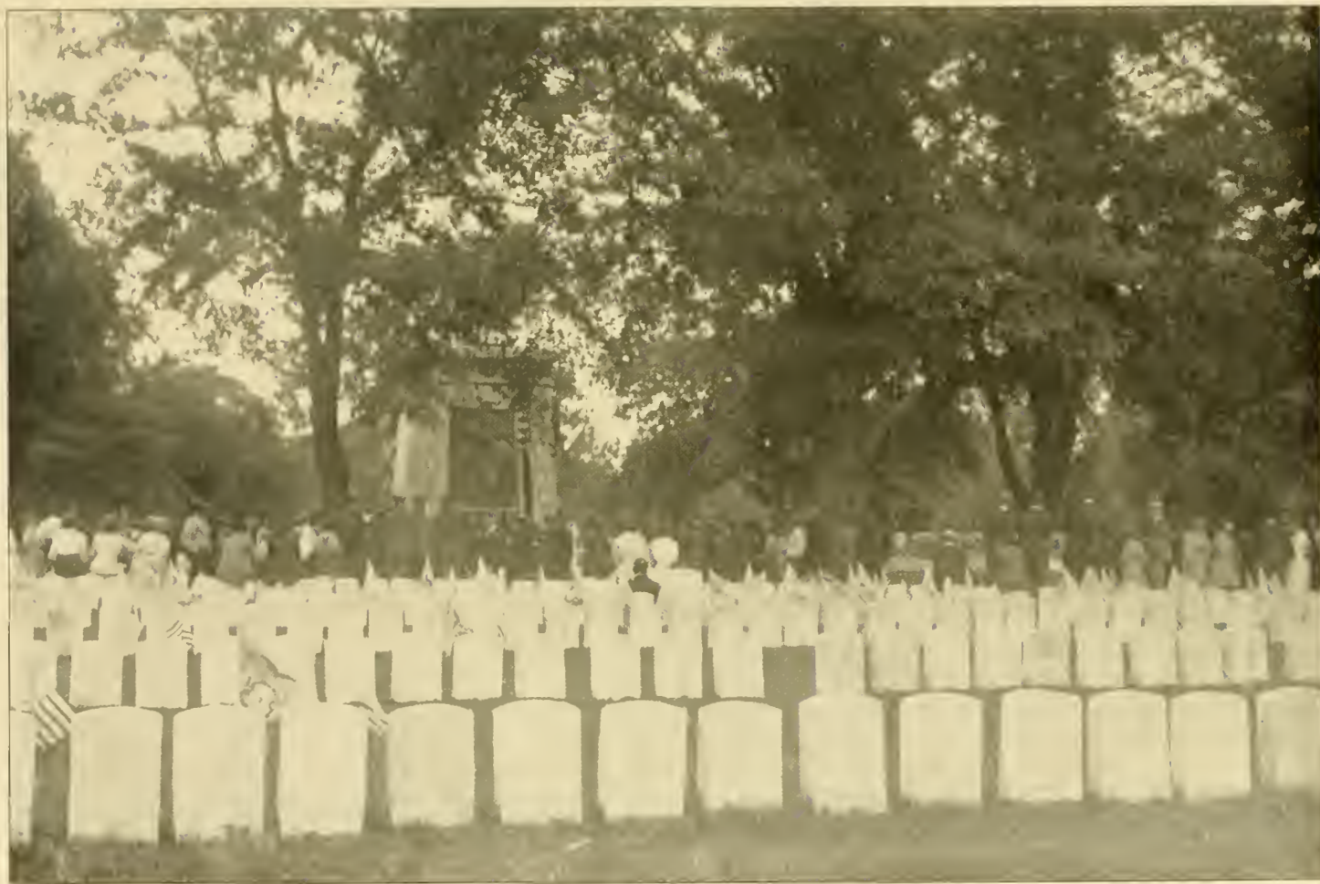
GRAVES ACROSS ROAD IN FRONT OF NEW YORK MONUMENT AT ANDERSONVILLE DURING DEDICATION CEREMONY