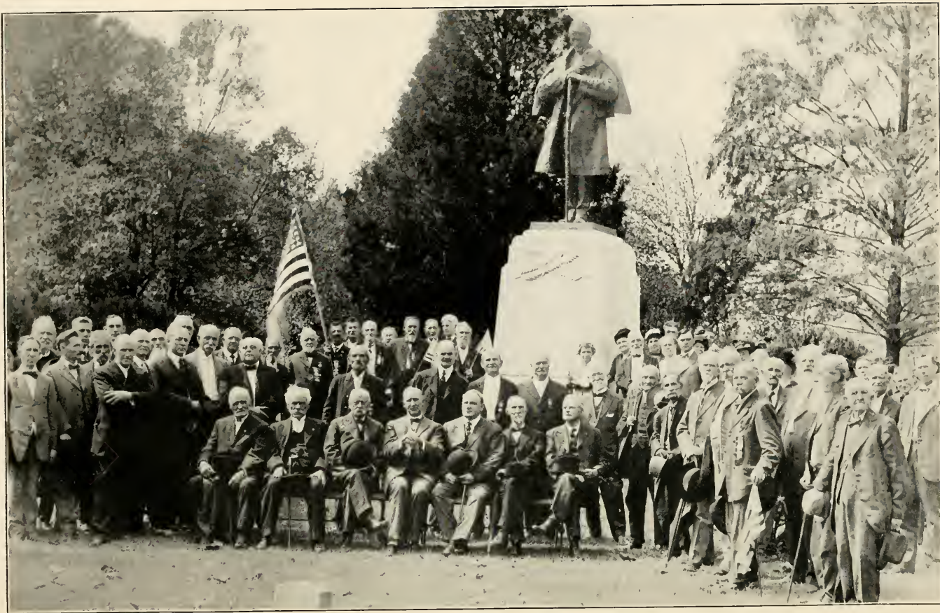
LITTLE ROCK MONUMENT, COMMISSION AND CITIZENS