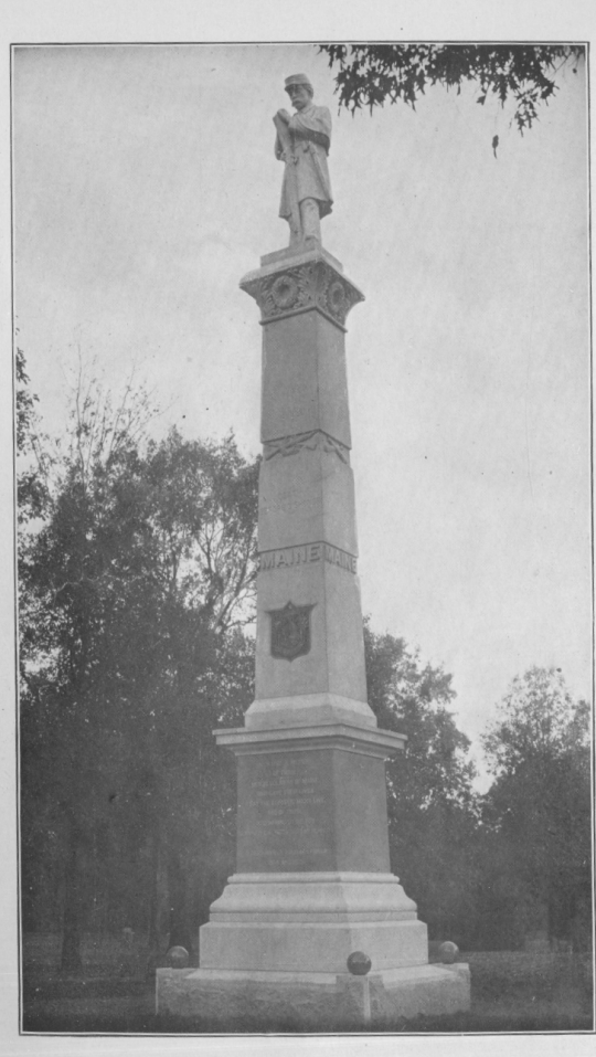
MAINE STATE MONUMENT AT ANDERSONVILLE, LOOKING SOUTHEAST.