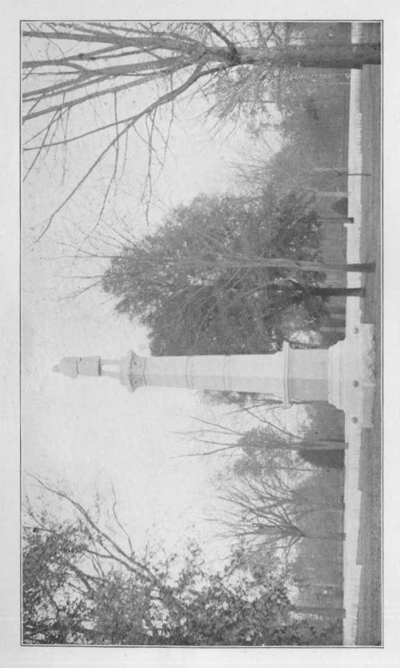
MAINE STATE MONUMENT LOOKING NORTHEAST.