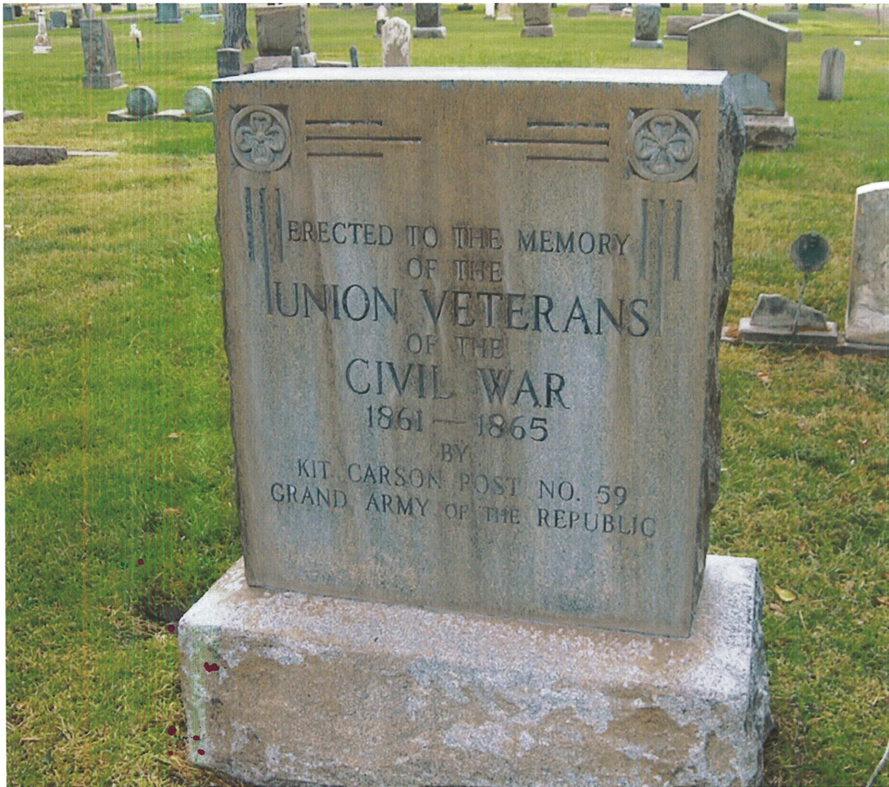
GAR MONUMENT RIVERSIDE CEM. LAMAR, CO