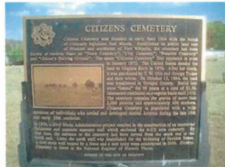
Only Plaque Currently in Cemetery