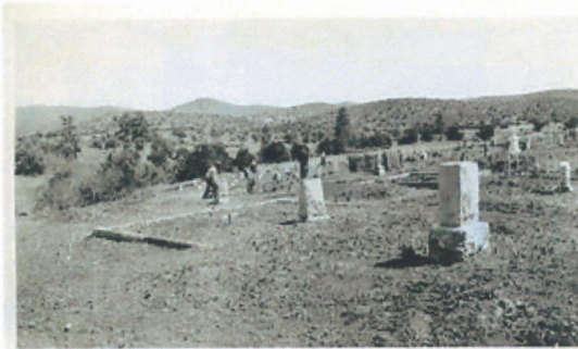
"In The Beginning"