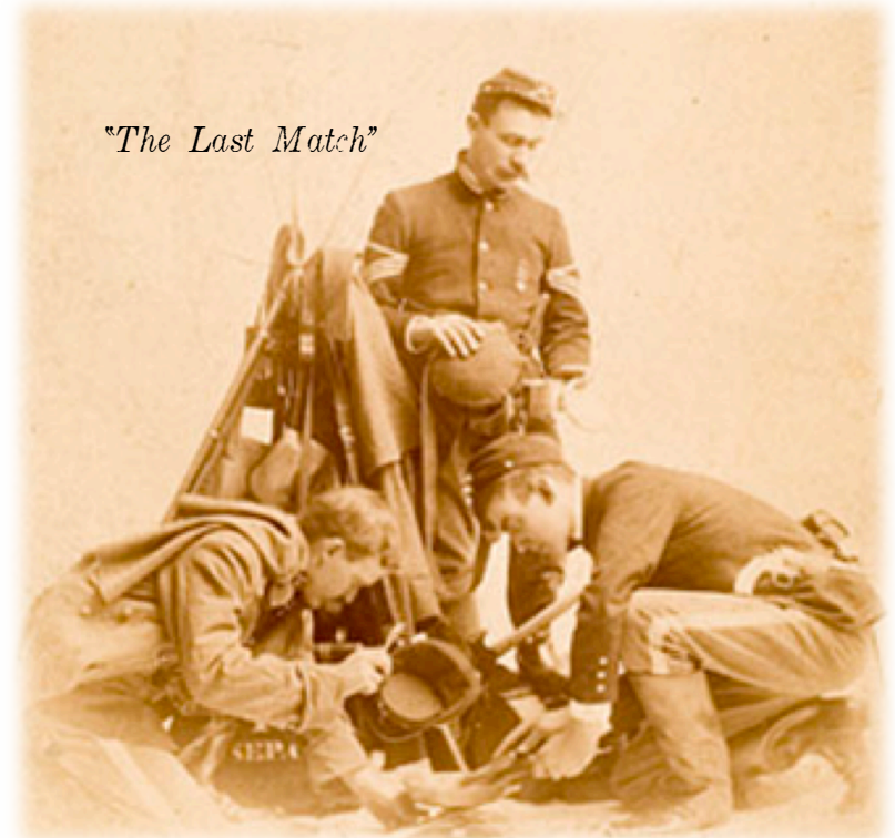
"The Last Match"

Los Angeles, California Friday, August 10, 2012