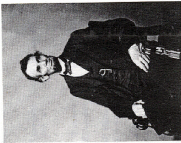
Abraham Lincoln 1809-1865

Honor'd leader, long and fondly Shall thy mem'ry cherished be; Hearts shall bless thee for their freedom, Hearts unborn shall sigh for thee; He who gave thee might and wisdom, Gave thy spirit sweet release; Farewell, father, friend and guardian, Rest forever, rest in peace.