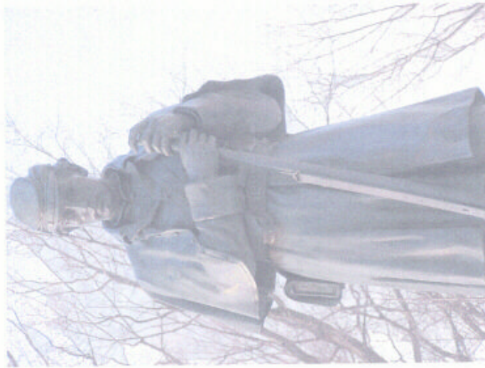
Roxbury Soldiers' Monument