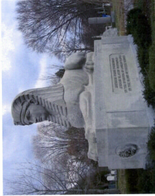
National Encampment Banquet