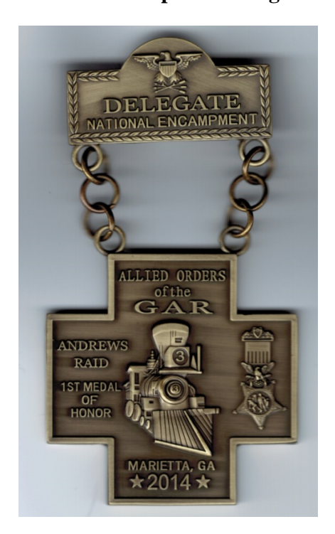
Souvenir 133<sup>rd</sup> National Encampment Medal