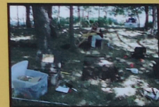
A volunteer archaeologist screens soil from a test unit during an archaeological dig at Battle of Island Mound State Historic Site.

There are still many questions about the Battle of Island Mound, the Toothman farm and Fort Africa. Artifacts and other evidence provide clues that help to tell the story about what really happened at this site.