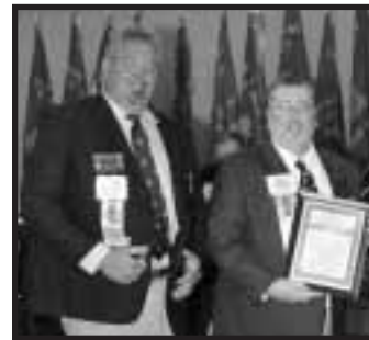
Marshall Hope Award Department Newsletter - Dept of CA/Pacific; Camp Newsletter – The Union Volunteer – Col Edward D Baker Camp 6, Camp at Large, Oregon