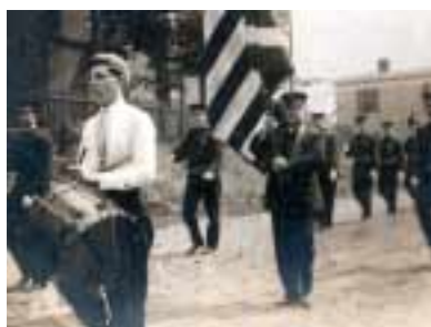
Parade from 1912 National Encampment in St Louis