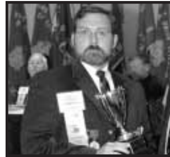
US Grant Cup – Dept of GA/SC and Dept of NC (both with 35% increase in membership)