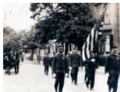
Camp Barton black segregated Camp (May 30, 1917)