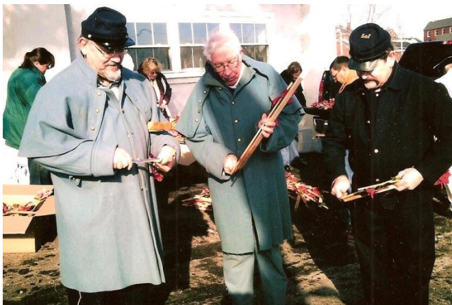
day to recognize Medal of Honor Recipients. All SVR Units are invited to participate.