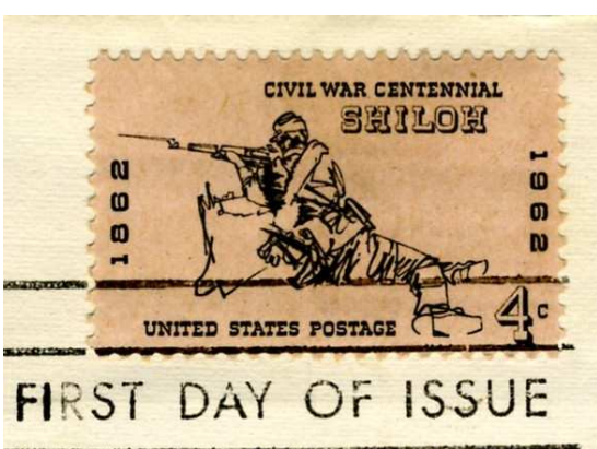
Map of southern Italy; Postage stamp commemorating the battle of Shiloh

Furthermore, the funeral ceremonies were to be devoid of any religious services. His obituary in the New York Times on the following day referred to him as "one of the most