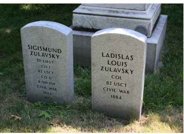
Kossuth statue in New York City; Graves of Ladislas and Sigismund Zulavsky