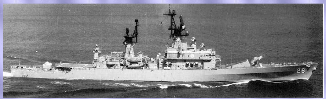
USS Belknap (DLG/CG-26), a Belknap class guided missile cruiser service from 1962 to 1995 For additional photographs, see: http://www.navsource.org/archives/04/040126.htm

In addition to her Presidential Unit Citation, Belknap received three battle stars for her World War II service.