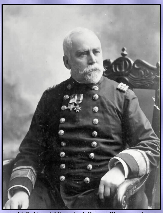
U.S. Naval Historical Center Photograph

By Douglas Niermeyer, Commander-in-Chief Military Order of the Loyal Legion of the United States momollus@usmo.com (September 2005)