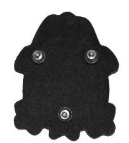
#781 Jacket Patch Removable from jacket to jacket or shirt $28.00 each