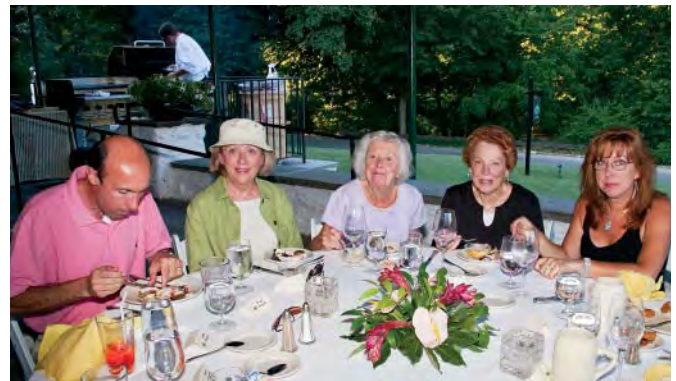
Guests included a whole row of Dames, above. Some of the food offerings, below. Left, a view of two of our tables.