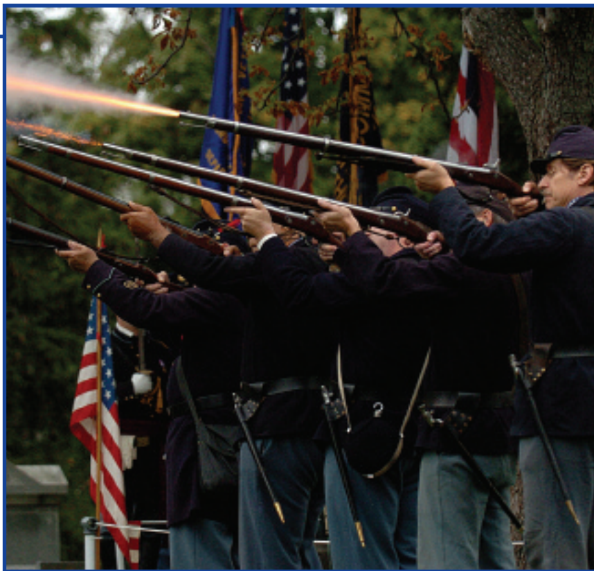
The festivities at the October 2007 rededication included reenactors and members of the Curtenius Guard, Camp 17, firing a ceremonial volley.

The lot was located on the highest spot in the cemetery. The Lansing Women's Monument Association raised the money and the base of the monument was erected and dedicated on Memorial Day 1877. According to the Lansing Republican , "It is a handsome piece of emblematic work, executed by home artists. The monument is constructed of Ohio sandstone and is 6 feet square. The