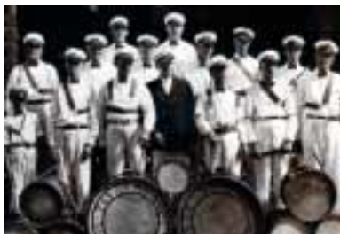
Drum & Bugle Corps