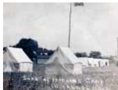
Pennsylvania Brigade, SVR (1916)