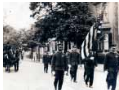
Camp Barton black segregated Camp (May 30, 1917)