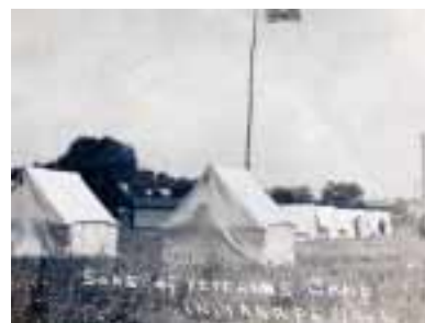
Pennsylvania Brigade, SVR (1916)