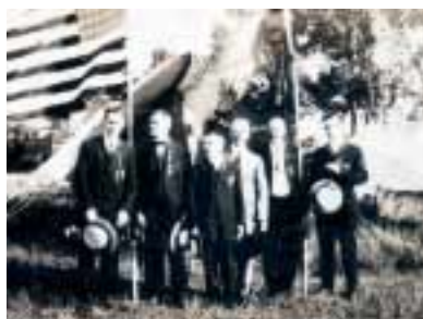
Second Regt Pa. Brig SVR

Installations, Department and National Encampments, Lincoln's Birthday and Tomb Ceremonies, the Civil War Sesquicentennial events of the next 5 years, and of course, activities of the last 125 years. Here are some of the pictures I have saved, that might inspire you to get started.