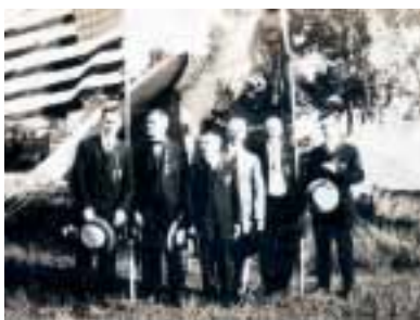
Second Regt Pa. Brig SVR

Installations, Department and National Encampments, Lincoln's Birthday and Tomb Ceremonies, the Civil War Sesquicentennial events of the next 5 years, and of course, activities of the last 125 years. Here are some of the pictures I have saved, that might inspire you to get started.