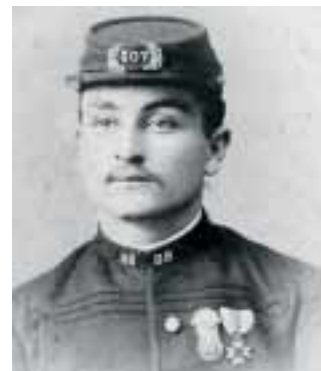
Post System Brother (note the post system badge) prior to 1887

Here is something we can all collect. If a picture is worth a thousand words, than think of the pictures you can collect to tell our story to future generations. Please be sure to identify people, places and date them. Keep photos from direct sunlight and moisture.