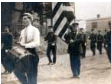
Parade from 1912 National Encampment in St Louis