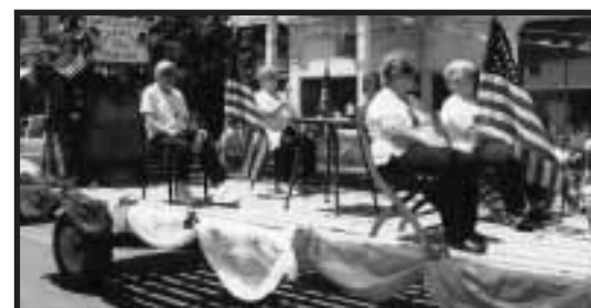
Auxiliary 72 ride their float, set up as a meeting room, in the Ovid Memorial Day Parade.